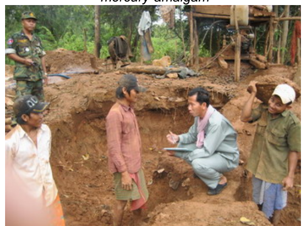
Interviews with gold miners at gold-mining site, Kampong Thom Province Figure 2: Gold mining activities and surveyed overview at gold mining site