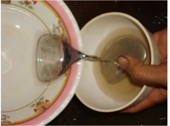
Pure mercury to be used for extracting gold from gold-ore

While the derived consumption interval, 34.5 - 1182 kg mercury/year is highly uncertain, it does illustrate a possible order of magnitude of the mercury usage for small scale mining in Cambodia. The minimum of the interval is most likely significantly underestimating the actual consumption. The derived maximum of the interval may overestimate the actual consumption, but is - based on the weak evidence used - not necessarily as high as the real consumption.