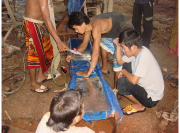
Miner washes the dirt out to obtain gold with mercury-amalgam