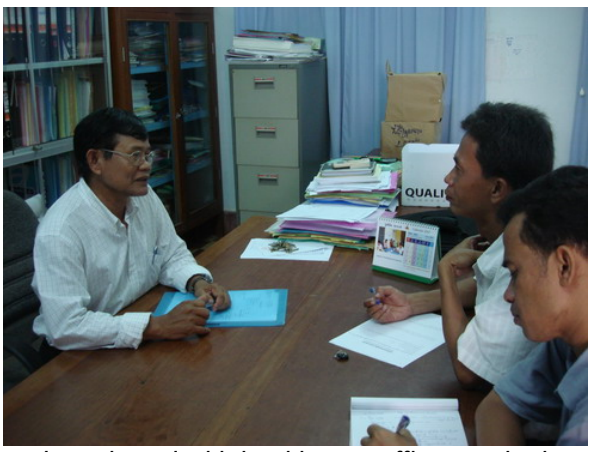
Interviewed with health care officer to obtain information on medical wastes disposal of