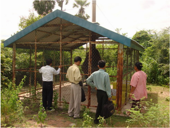
A type of medical waste incineration facilities operating in Cambodia