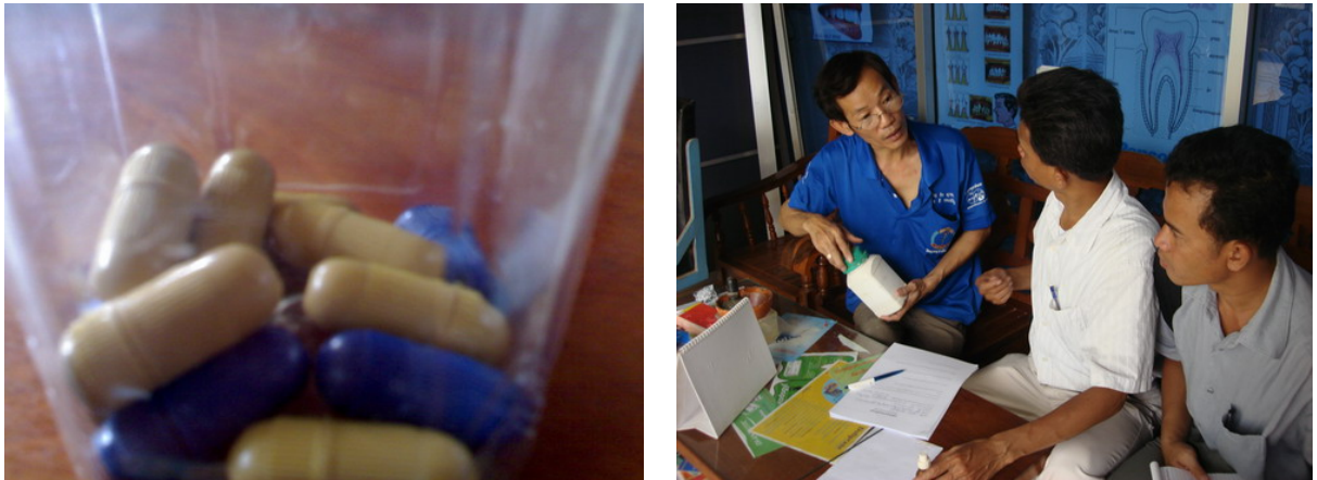
Mercury amalgam in capsule Interviewed with dentist Figure 3: Inventory team conducted mercury survey activities at dental clinic

According to dentists report, it is known that amalgam is usually supplied in two forms either 1) as pure mercury along with a powder mix of the other metals, which are weighed and mixed in the clinic; or 2) as small capsules where mercury and the metal powder are present in the right proportions and need only to be mixed (in the capsule before opening) in the clinic, prior to filling the cavity in the tooth. Amalgam in capsule form is favorite use by dentist in Cambodia compared to the other form currently.