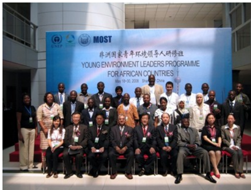
Young Environment Leaders Programme for African Countries held by Tongji University

Based on the achievements gained under the triangle cooperation, communication mechanisms have been built, construction of demonstration projects, and technology training programmes held among others, show wider range of achievement. UNEP and MOST are planning to move the cooperation programme forward and make it a big success case for South-South and Triangle Cooperation.