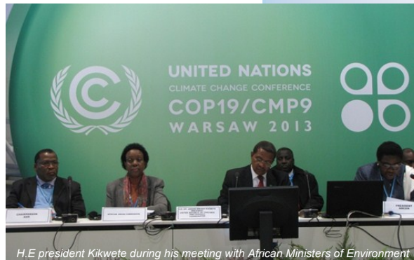
H.E. president Kikwete during his meeting with African Ministers of Environment

The AMCEN Consultative meeting held on Sunday, 17 November 2013 at Radisson Blu Centrum Hotel in Warsaw, brought together ministers, to refine their strategy for negotiation and for engagement with other important parties and groups, building on the outcomes of the 5th special session of AMCEN. The meeting also provided an opportunity for the Africa Group of Negotiators (AGN) to update the Ministers on the state of the negotiations, including on issues at stake such as Finance, Adaptation and Technology transfer, including addressing Intellectual property rights and the strategy to be adopted to get the best during the high-level segment with a rallying call for “One Continent, One Voice”. Ministers also emphasized the need for the second commitment period of the Kyoto protocol to come into force early. In addition and as a follow up on their request for scientific back up for climate change impacts and cost of inaction, the Africa Adaptation Gap technical report produced by UNEP was presented. As a follow-up, Ministers called for an African Adaptation programme, also thanking UNEP for this report. The report generated exceptional interest with more than 500 news media across the world reporting about the launch as well as more than 5000 people downloading the report by the end of the day after its launch.