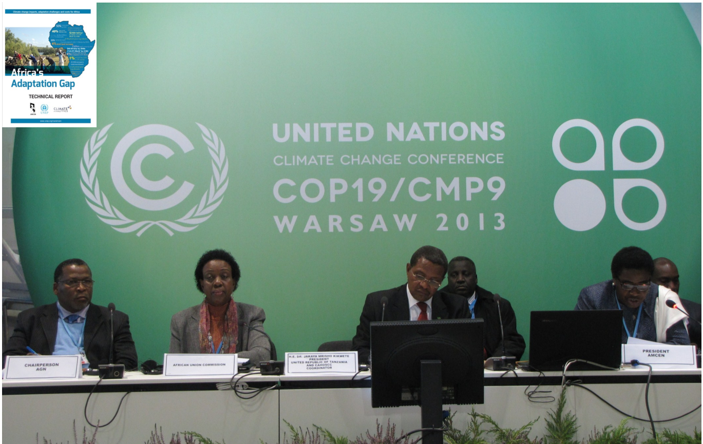
African Representation during the UNFCCC COP -19 at Warsaw