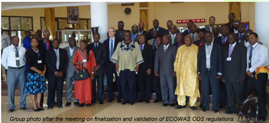
Group photo after the meeting on finalization and validation of ECOWAS ODS regulations

the ECO-WAS region in readiness for approval by ECO-WAS Ministers of Environment and sub-