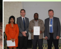
UNEP (FMO) receiving certificate of completion of the training