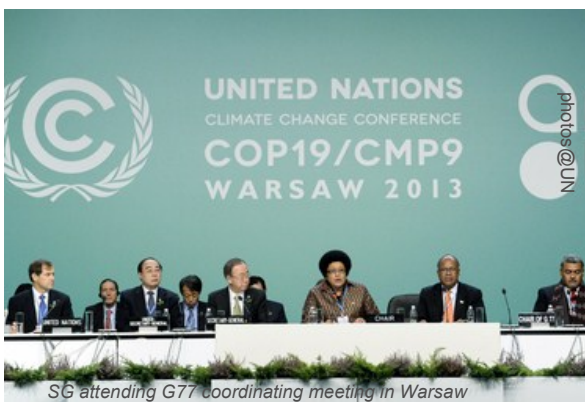
SG attending G77 coordinating meeting in Warsaw

As a step forward, AMCEN Secretariat will initiate discussions with potential partners regarding the proposed Africa Adaptation Programme. UNEP will also start working not only on the second Africa Adaptation Gap Report for 2014 but also on the Report on Impacts of Climate Change on Economic Growth in Africa.