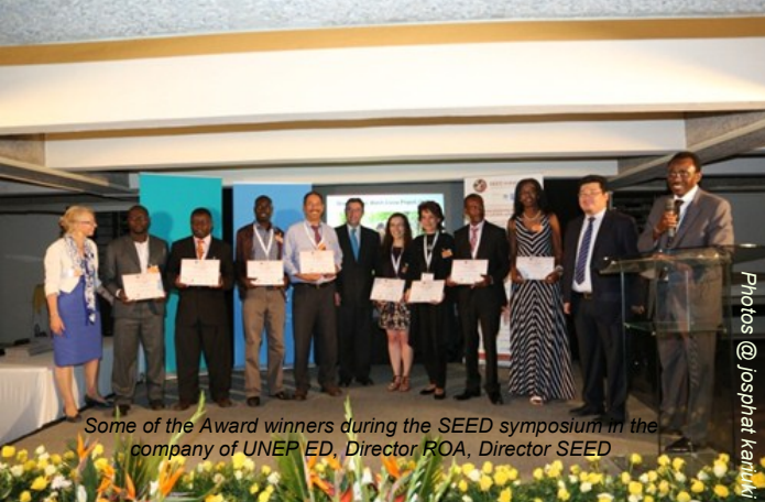
Some of the Award winners during the SEED symposium in the company of UNEP ED, Director FOA, Director SEED

economy- S E E D Initiative, supports innovative small-scale and locally driven entrepreneurs around the globe who integrate social and environmental benefits