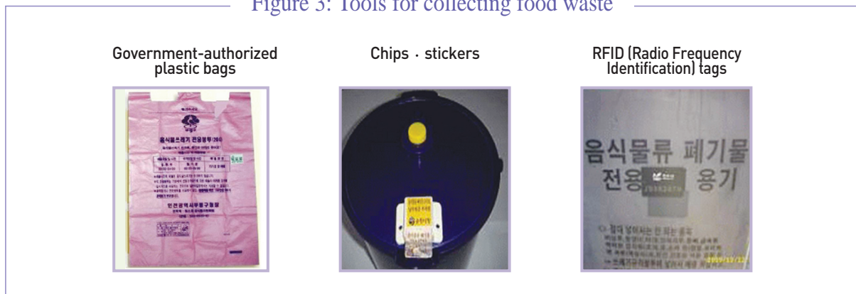
Figure 3: Tools for collecting food waste

Another area where green life takes on a significant meaning is people's homes, as those are where people spend their time more than anywhere else. In addition to people's voluntary and conscious efforts to save energy (e.g., turning off the lights, taking showers rather than hot bath, etc.), some physical and mechanical improvement of home appliances can also contribute to energy saving and eventually to the reduction of GHG emissions. For example, LED light bulbs, water-saving gadgetry, and other energy-efficient appliances can replace the