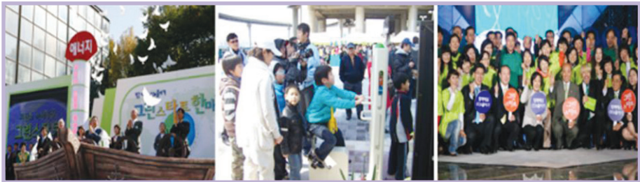
Figure 2: The Experiential Program of the Green Start Movement

The Movement has promoted and sponsored a variety of events and campaigns to materialize concrete results through the governance of the government and citizens. Among them are an annual call for ideas of green life implementation and support for wide networks since 2009, weekly national events on climate changes, the “Green Sports” campaign for the GHG emissions reduction in the area of sports, the campaign for