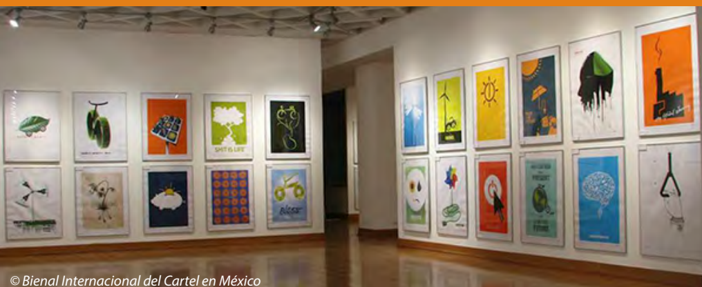
© Bienal Internacional del Cartel en México

The director of the International Poster Biennial in Mexico, Xavier Bermúdez, expressed his gratitude for the unconditional support provided since 1992 by UNEP in launching these poster events. The theme for category "D" of the 2013-2014 edition is "Think. Eat. Save. Reduce Your Footprint!" in line with UNEP's global campaign to reduce food waste and food loss.