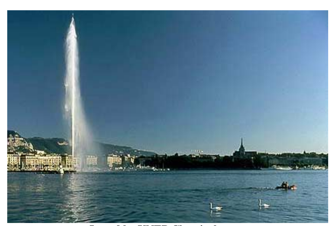
Issued by UNEP Chemicals Geneva, Switzerland 2001

Overview of international agreements/instruments, organisations and programmes concerning chemicals management (3<sup>rd</sup> edition)