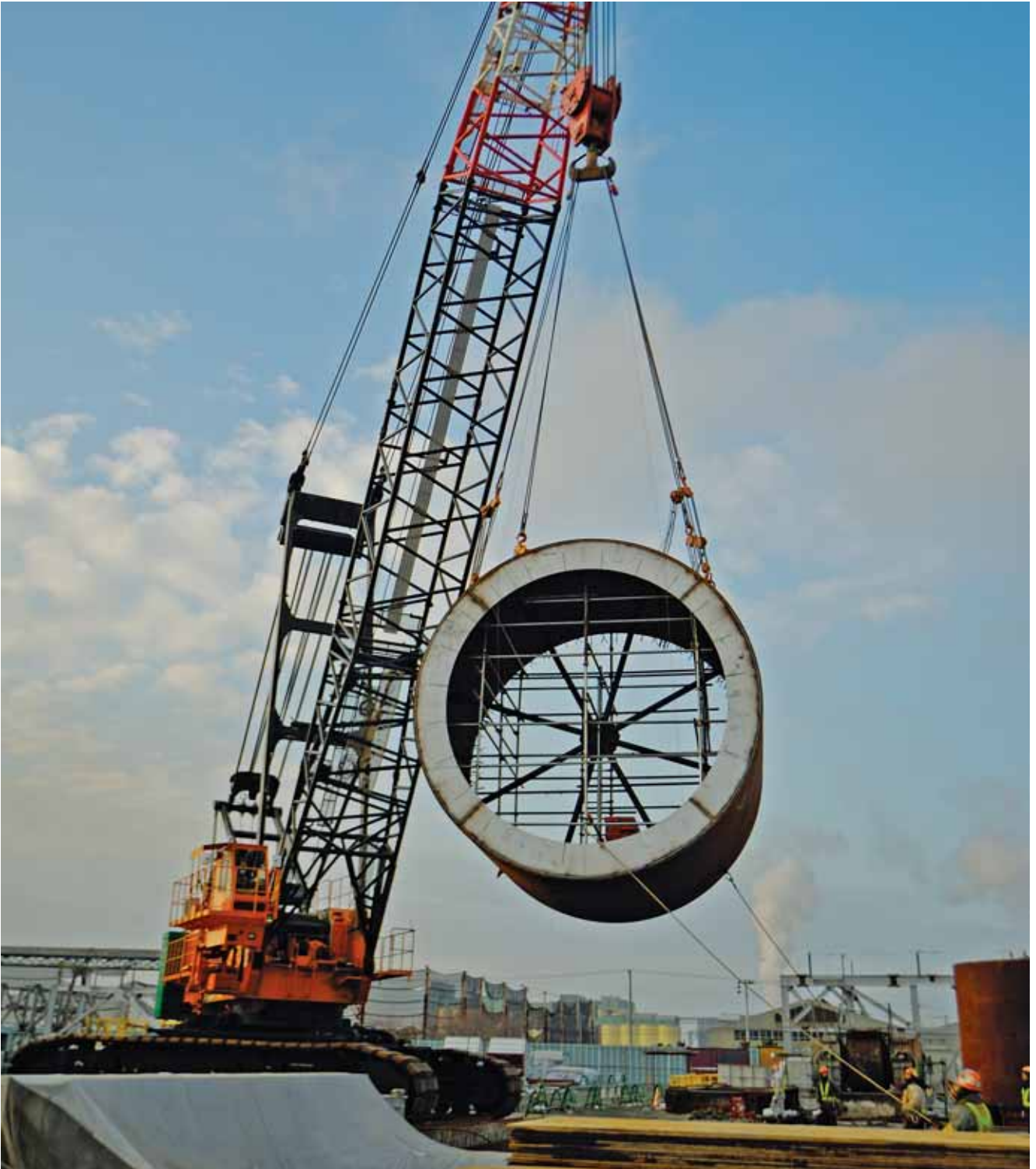
Fast-paced construction at Ishinomaki