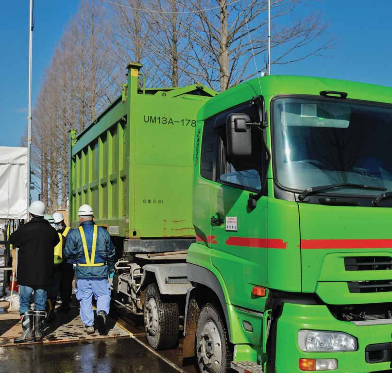
A shipment of mixed tsunami debris leaves Miyako for Tokyo