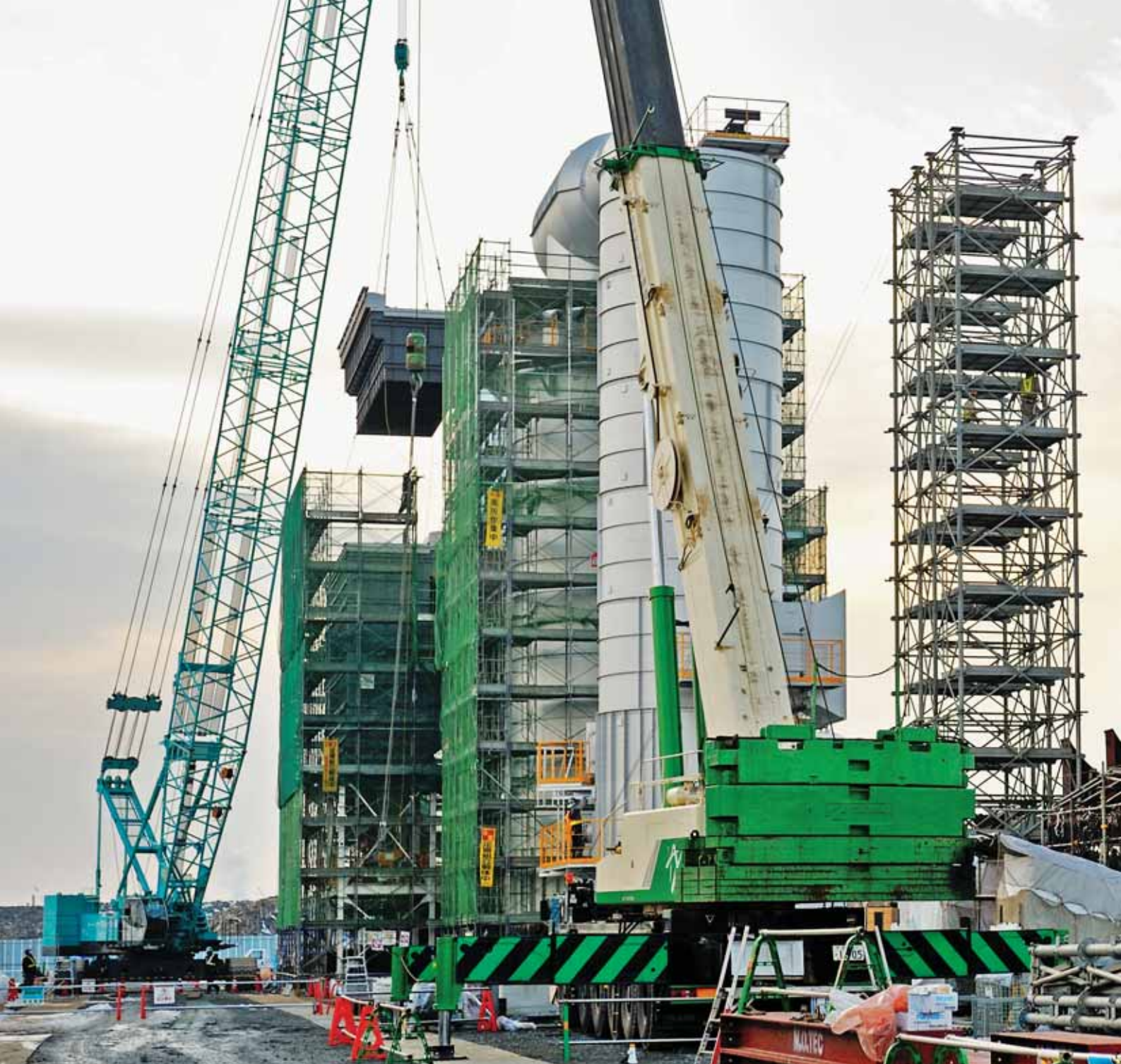
An incinerator under construction in Ishinomaki is due to be the largest in Japan