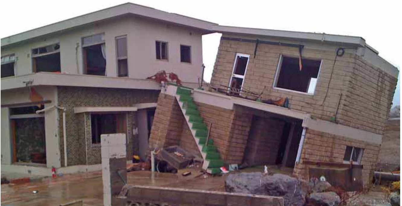
More than 400,000 people were displaced following the triple disaster

This report focuses on the enormity of the post-disaster debris challenge and documents the response by the people of Japan and key learnings one year after the event.