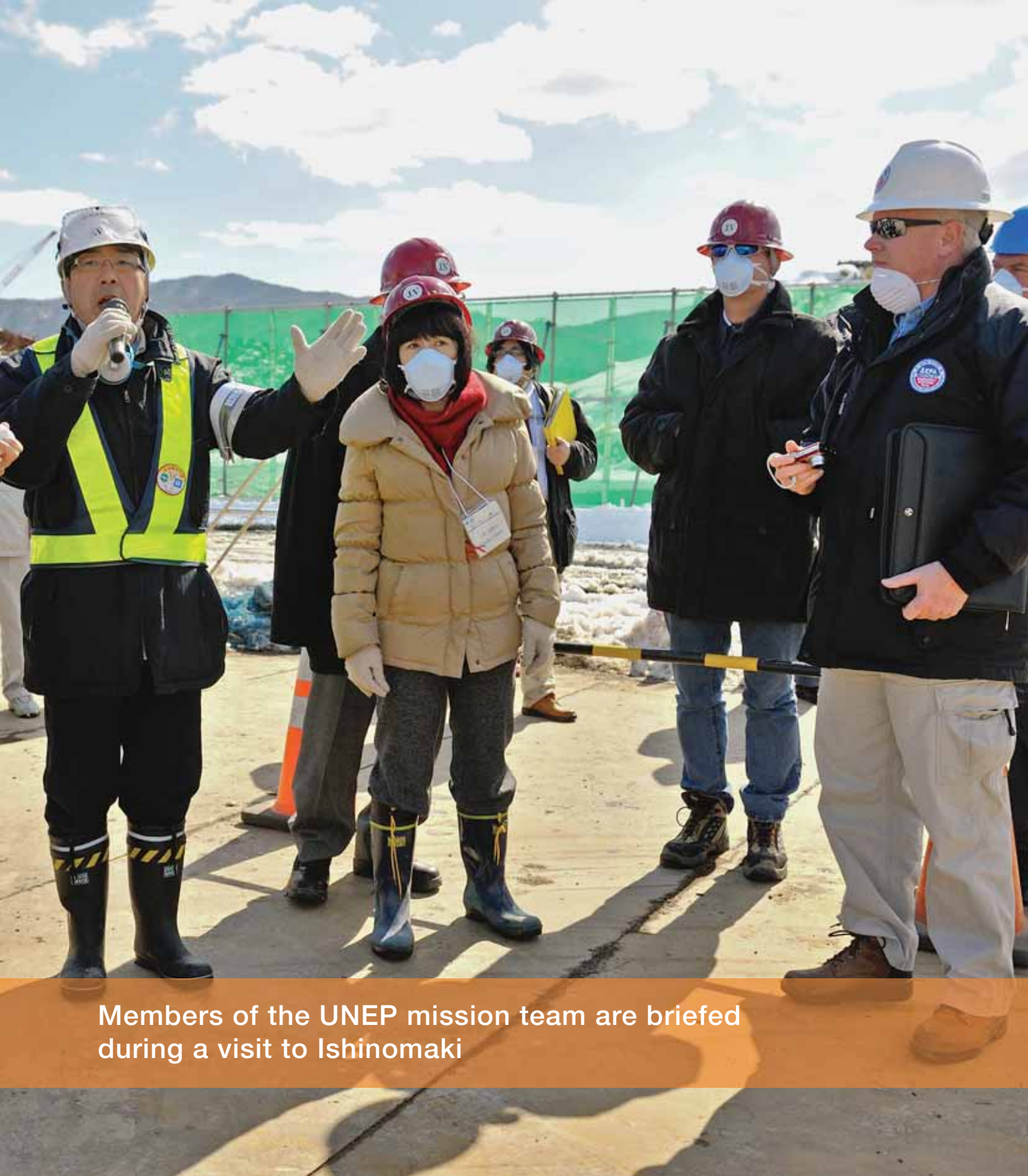
Members of the UNEP mission team are briefed during a visit to Ishinomaki