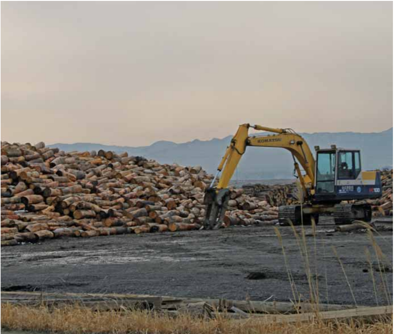
The destruction of coastal forests by the tsunami created piles of timber which are now used for a range of purposes

At the incineration facility visited, there were good health and safety arrangements in place, including fencing, visitor registration, personal protective equipment arrangements for the staff and visitors.