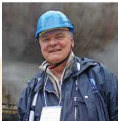
Mario Burger Spiez Laboratory