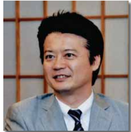
Koichiro Gamba Minister for Foreign Affairs, Japan

Because of the frequent occurrence of natural disasters, building a resilient society against natural disasters is more important than ever. Japan intends to share its experiences and lessons learned from this earthquake and the reconstruction process with the international community. Japan would like to cooperate with UNEP/IETC to make this newly born Kizuna of some help to reconstruction of the affected areas and to further expand the network of Kizuna throughout the world for facilitating more resilient society.