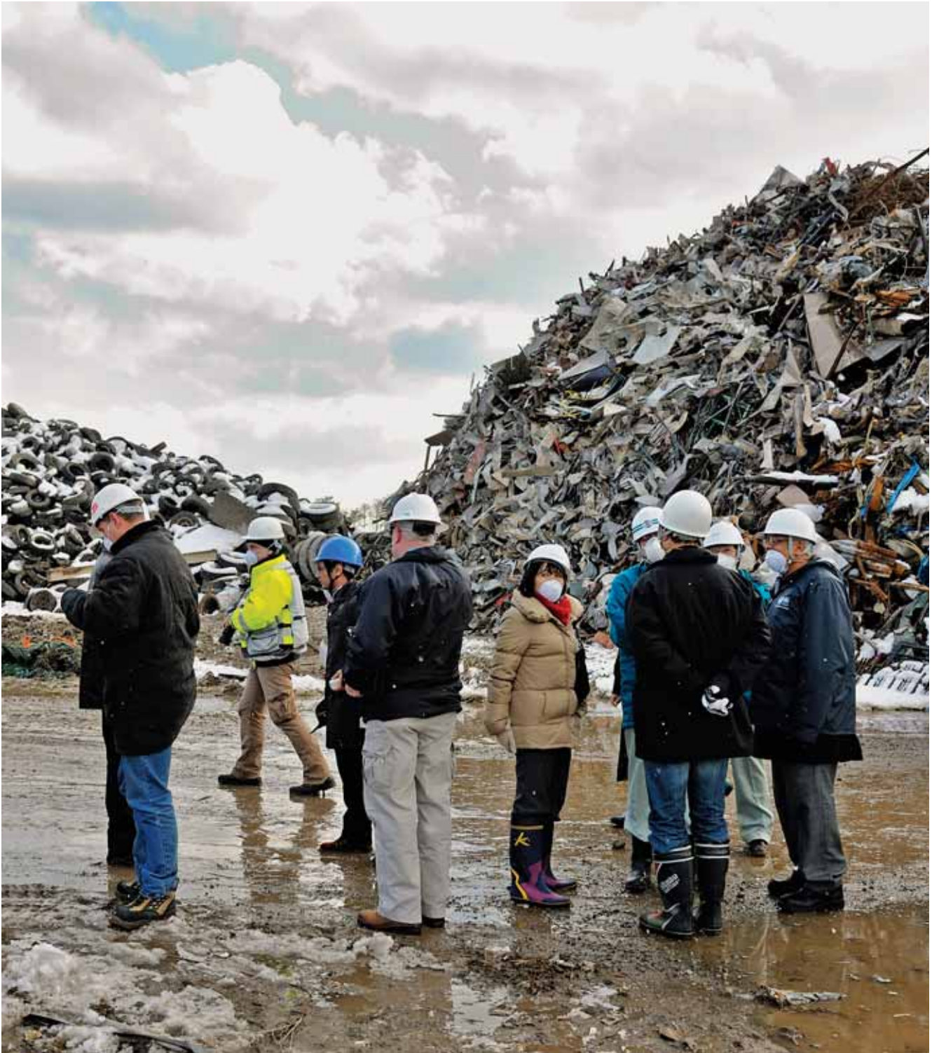
UNEP hopes to use data from the mission to develop an international protocol for estimating the volume of debris in post-disaster settings