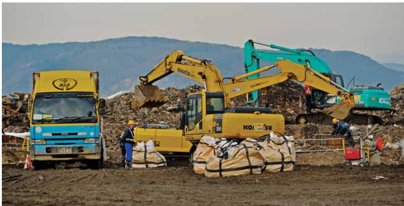
The disaster generated an unprecedented volume of debris which will take several years to clean up

“Due to a shortage of land, waste management in Japan is a challenge even during normal periods. The generation of large quantities of disaster debris thus makes the entire operation extremely challenging, both technically and financially.”