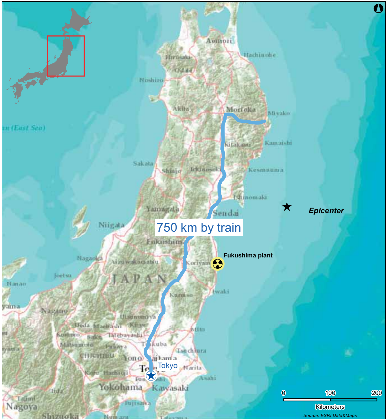
Map 2. The route for transporting mixed combustible waste from Miyako to Tokyo for final treatment and disposal