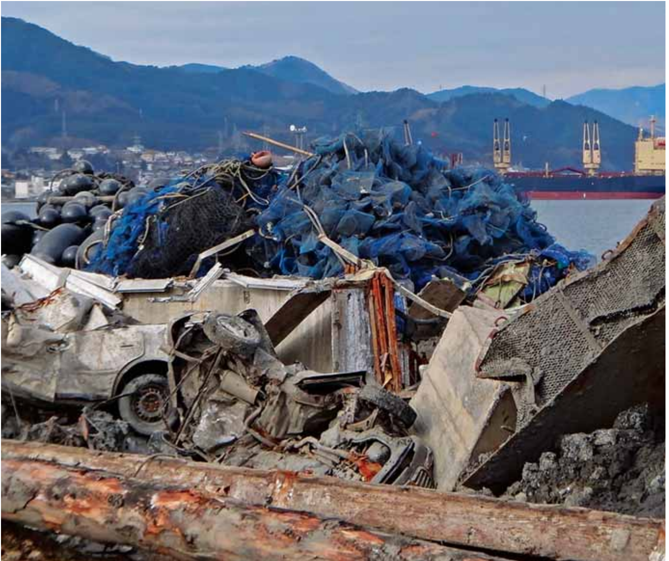
Tons of debris have been recovered from coastal waters in the Tohoku region

distinguish between the feed and floating plastic debris of similar size. As a consequence the parent albatrosses feed their chicks with an increasing portion of plastic material, with serious impacts on the populations of these birds. The arrival of unknown but large quantities of debris from the tsunami has compounded the problem.