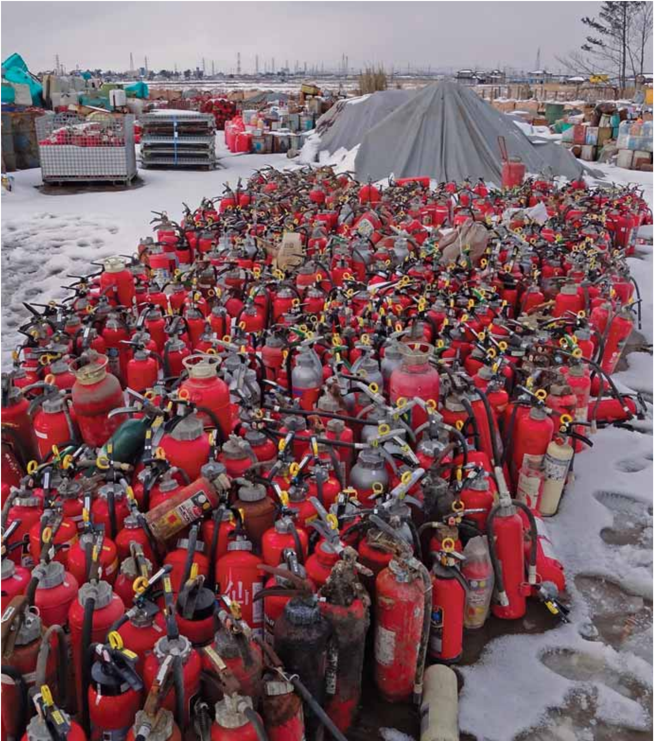
Guidance notes provided by Japan's Ministry of the Environment advised municipalities on segregating debris