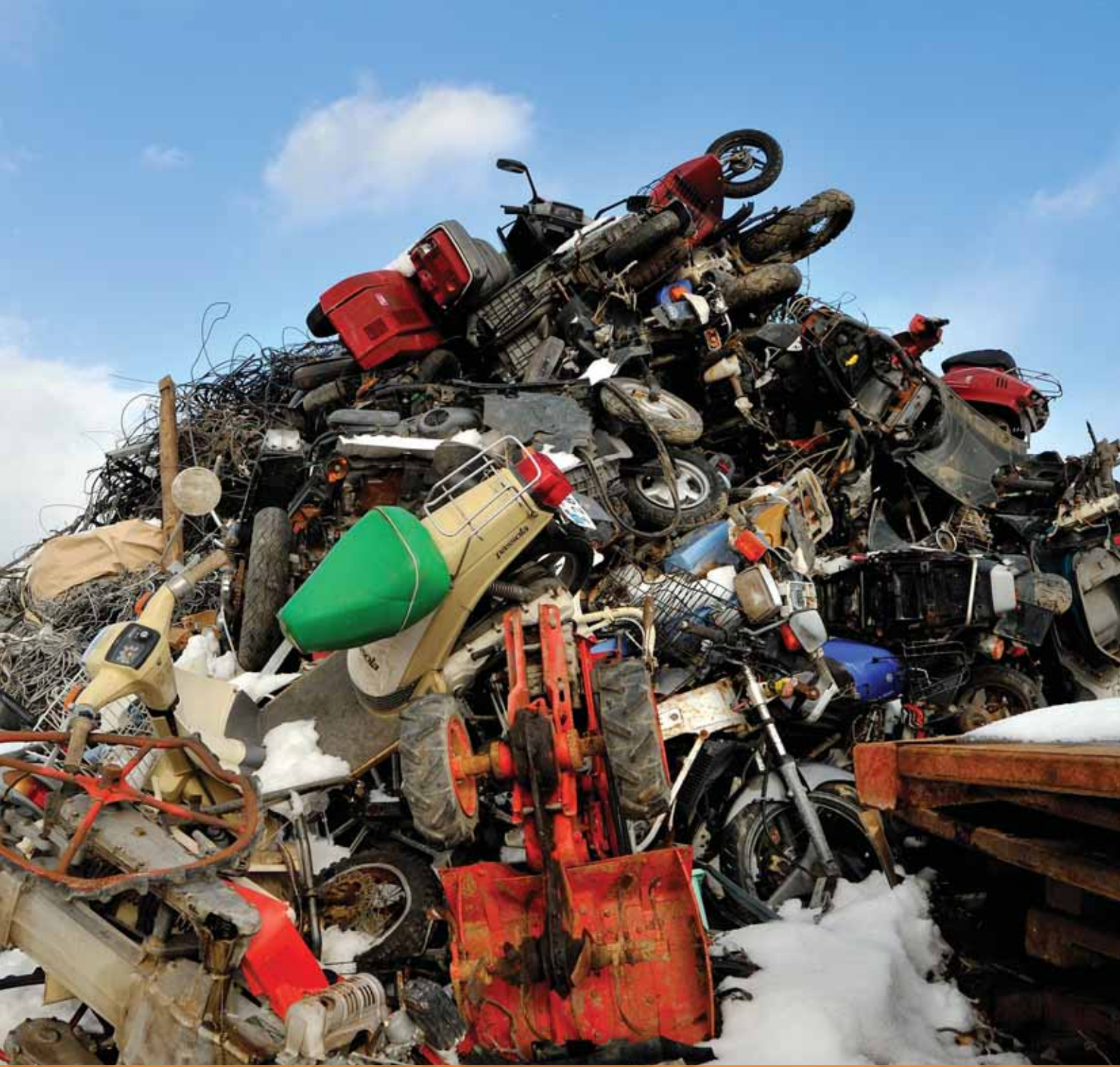
Stack of two-wheel vehicles in Sendai City awaiting identification by their owners