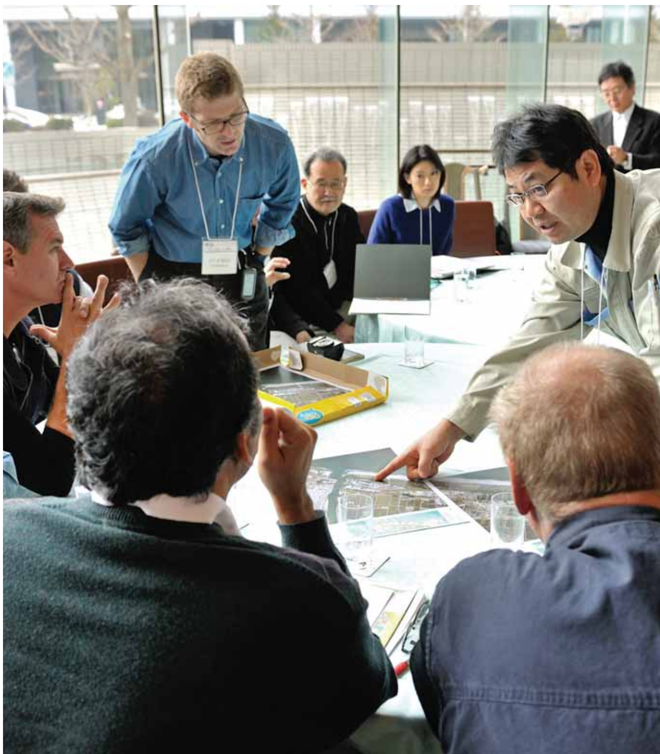
Initial meeting for the UNEP International Expert Mission in Sendai