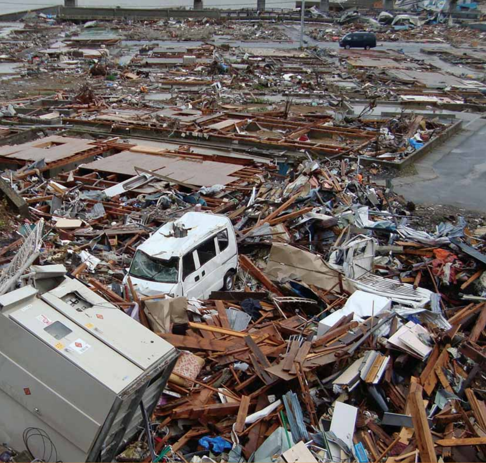
Mixed debris in Minami Sanriku