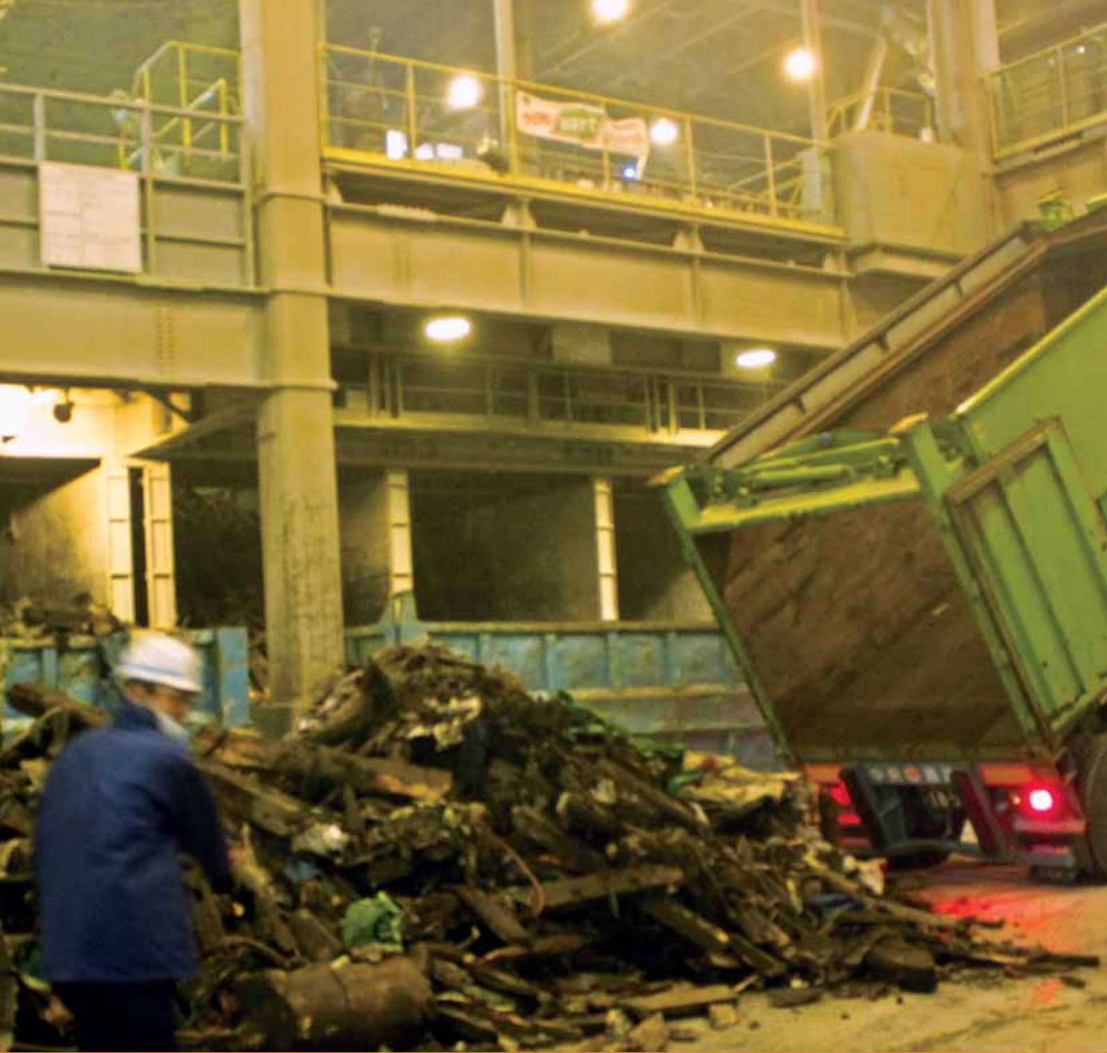
Debris from Miyako is unloaded at the Recycle Peer Company in Tokyo