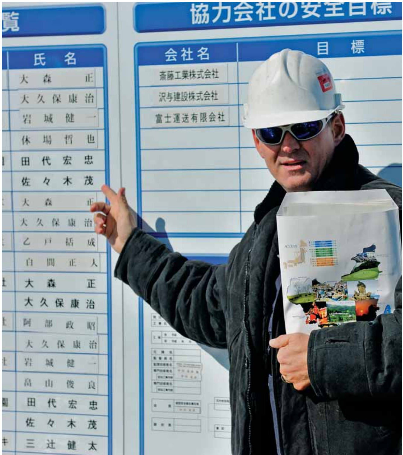
An example of the environmental monitoring results displayed publicly outside debris processing centres