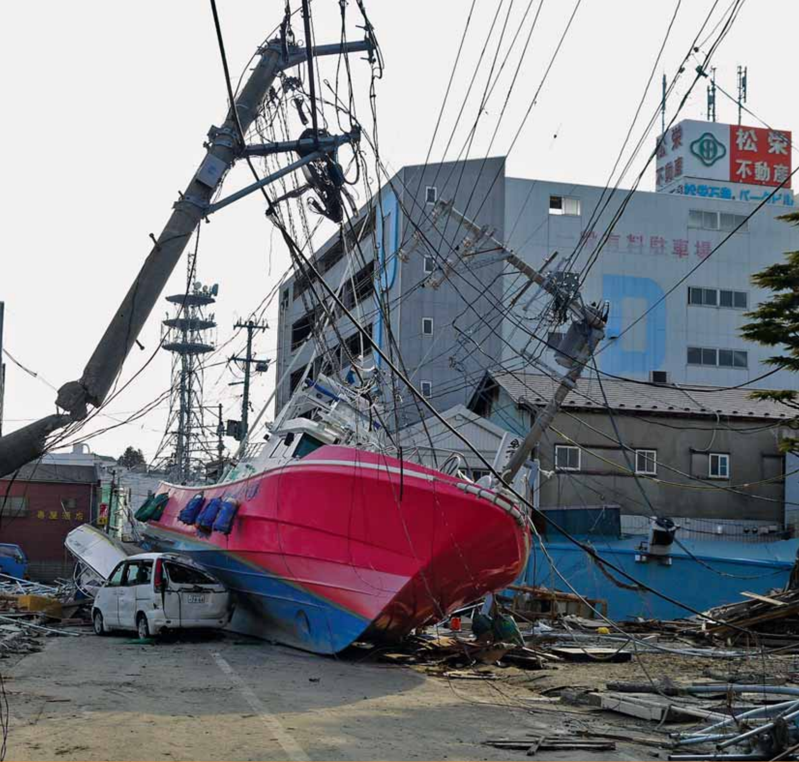
Boat swept into the centre of Ishinomaki City by the tsunami