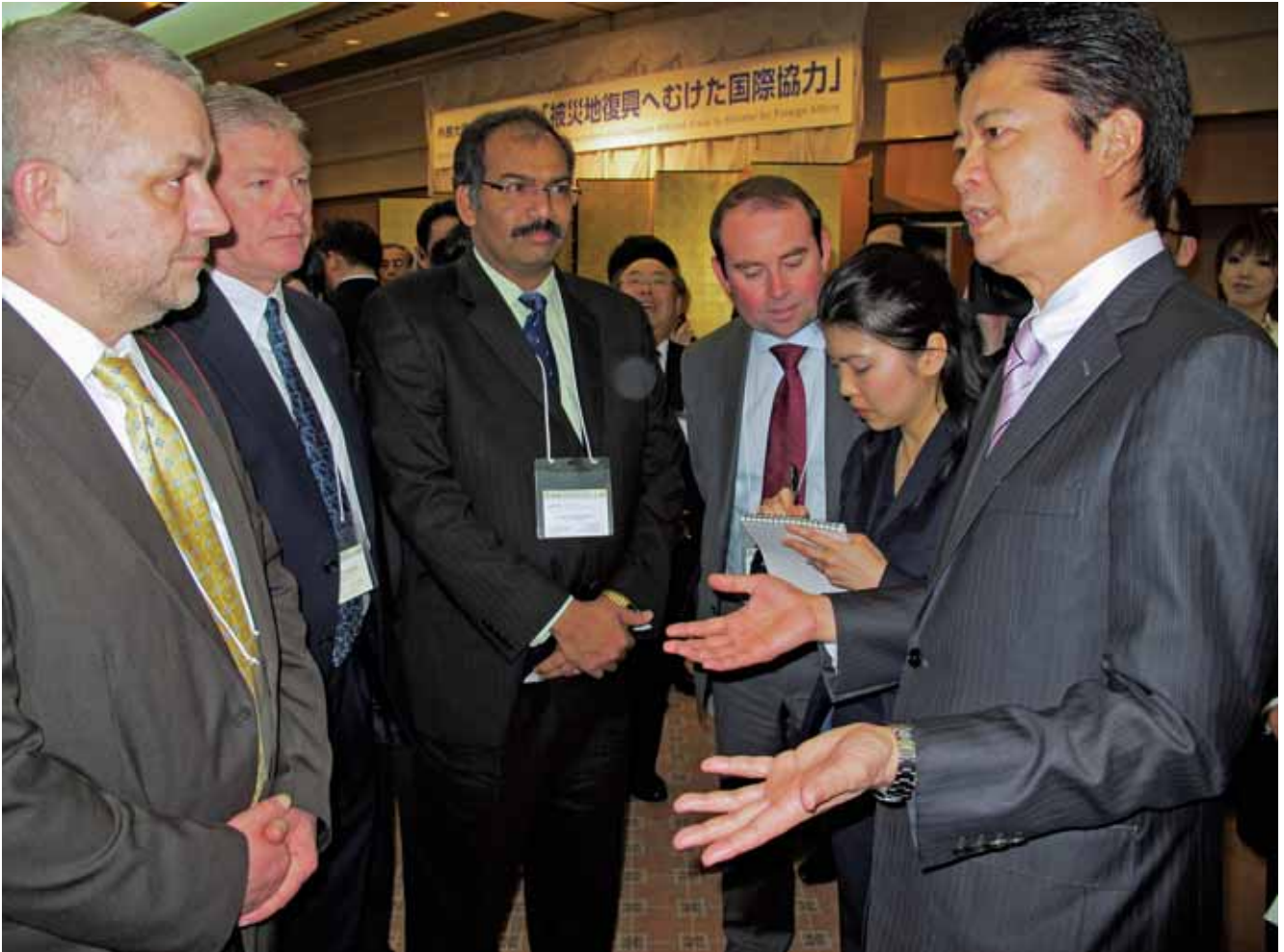
Members of the UNEP expert mission team meet Japan's Minister for Foreign Affairs, Koichiro Gemba