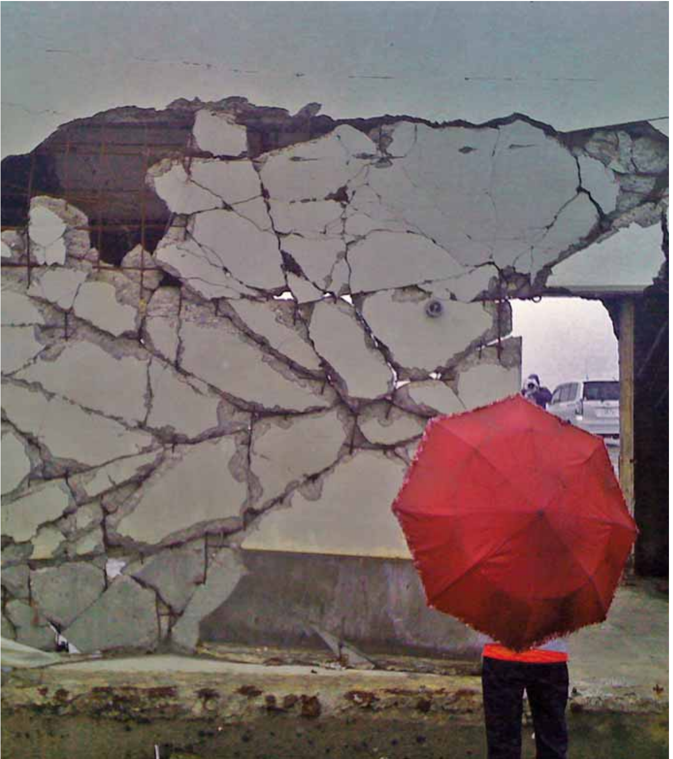
Such was the scale of destruction, a number of communities may never fully recover