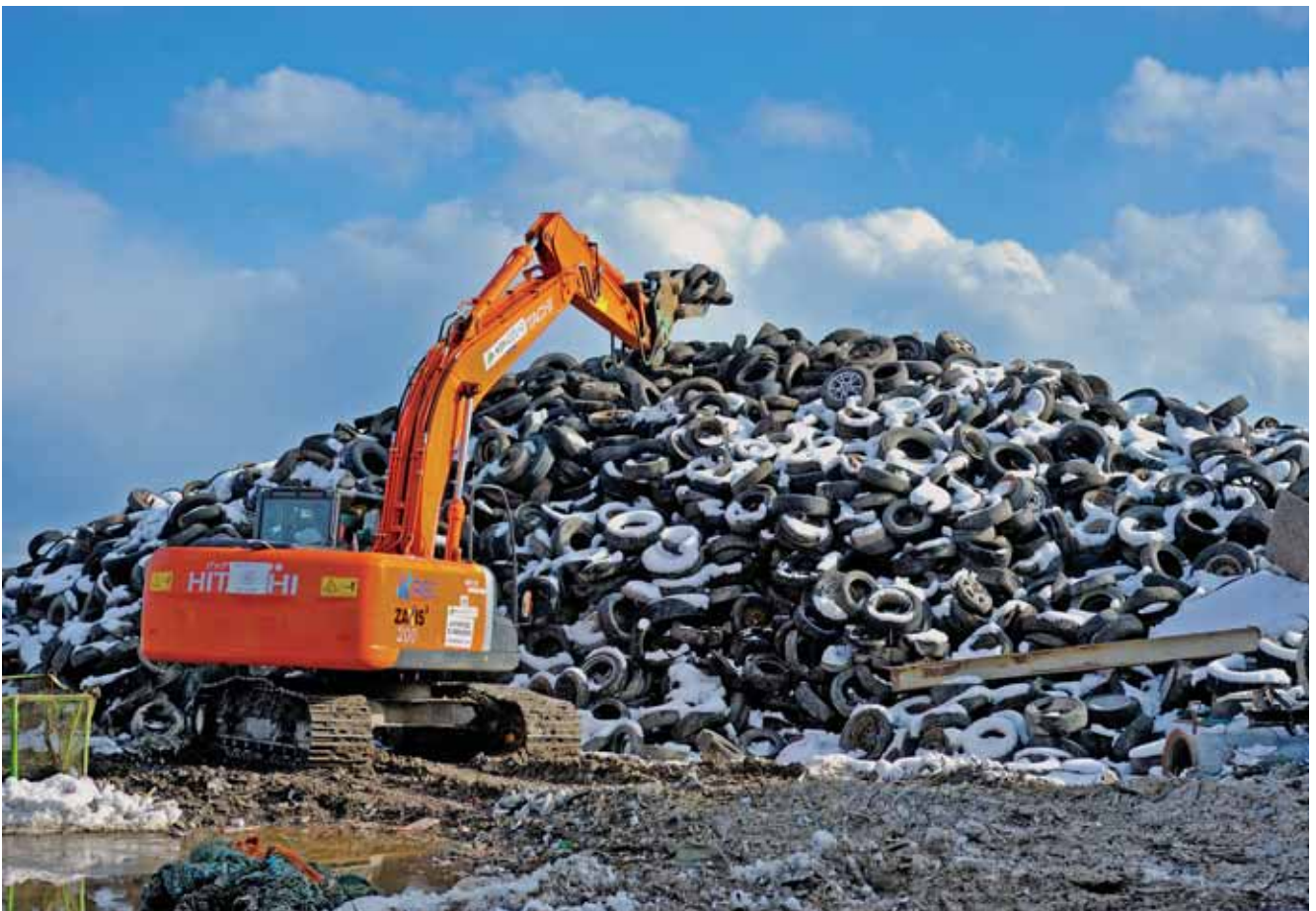
Pile of tyres at Arahama

The mission team felt the management of hazardous waste at this site could be improved, preferably by moving it to an offsite location with more secure containment and roofing which would ensure the safety of the materials as well as the health of staff working on-site. The storage of automobiles, and in particular two-wheelers, could also be improved as they were stacked without first removing the fuel.