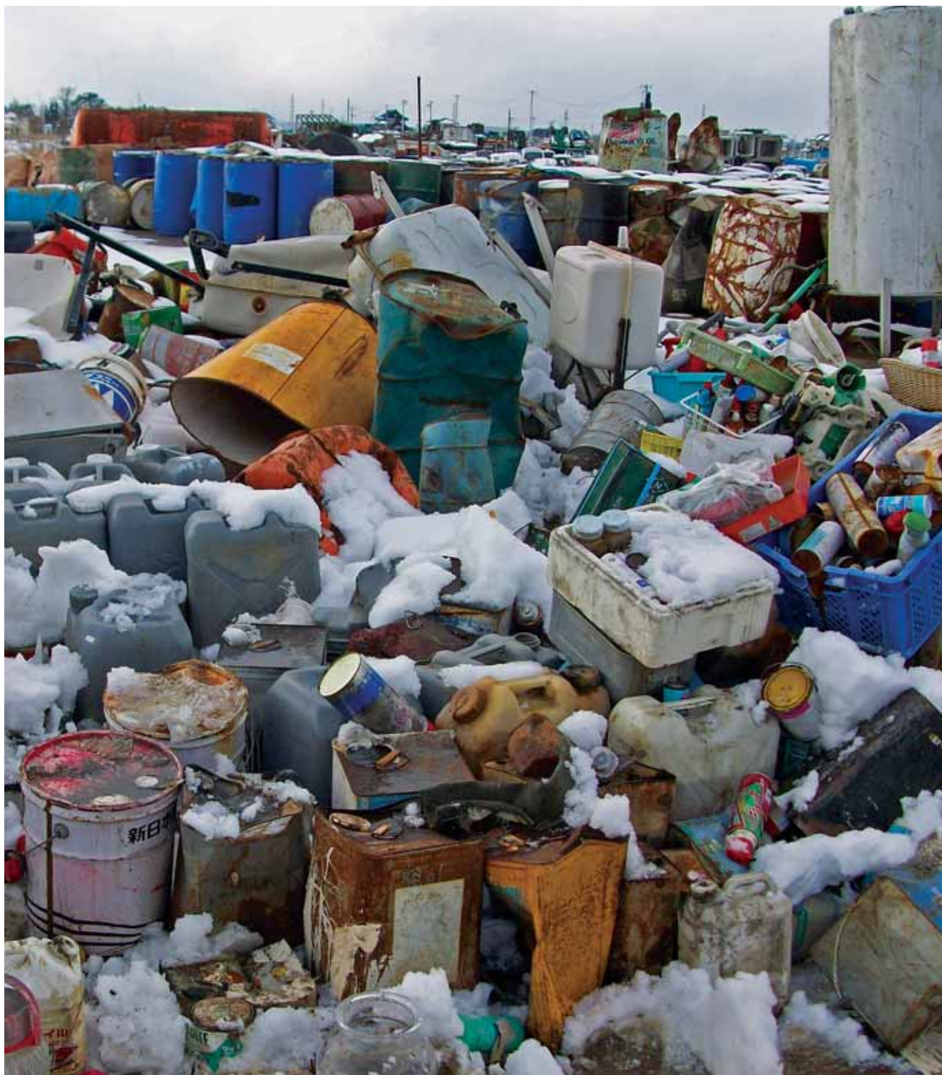
In some cases, potentially hazardous materials were kept in the open