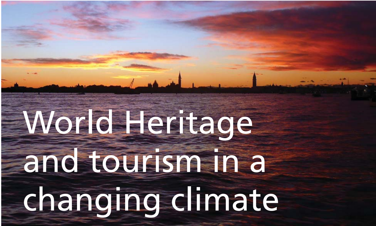
Venice and its Lagoon, Italy