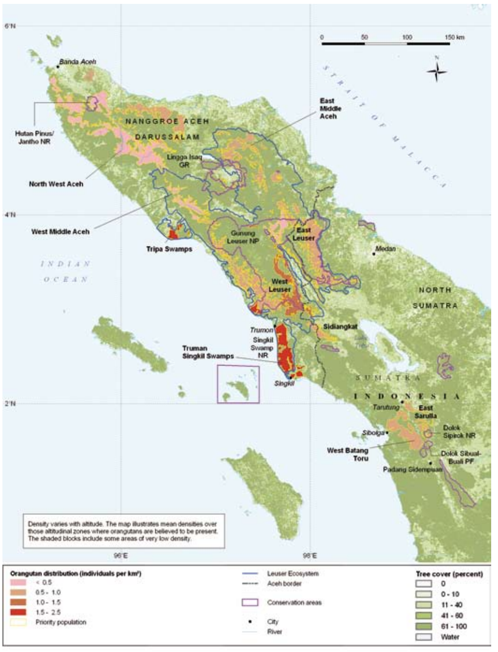
Figure 2: Sumatran orangutan distribution, with priority populations highlighted. Reproduced from Caldecott & Miles (2005); updated with GRASP priority populations. Sources: Dadi & Riswan (2004); Singleton et al. (2004).