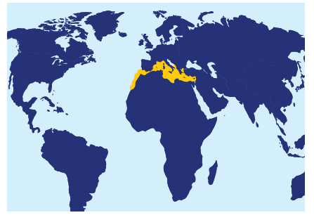
Mediterranean Monk Seal Distribution

Their new habitats are also inadequate, as females are forced to pup in sea caves, which are relatively undisturbed areas but particularly exposed to rough waves and bad weather conditions. This situation threatens the survival of baby seals, which may be swept away and injured or drowned during storms.