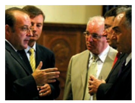
Lebanese Environment Minister briefing UNEP Executive Director about the Lebanese oil spill.