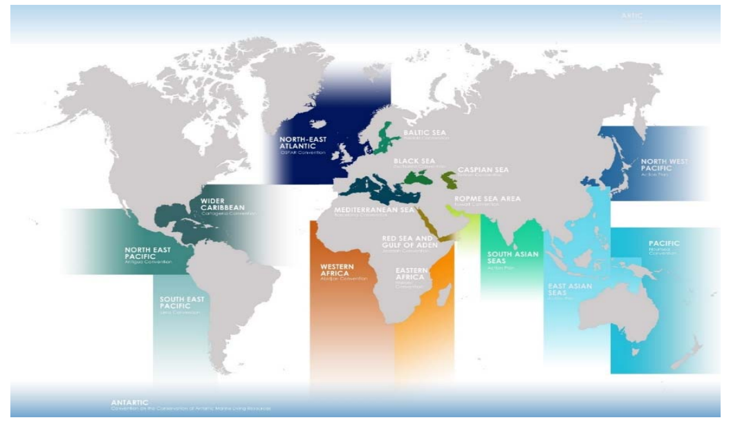
Figure 3 Map of the regional seas programmes

15. Existing regional seas conventions and bodies, in particular the Convention for the Protection of the Marine Environment and the Coastal Region of the Mediterranean (Barcelona Convention), the Nairobi Convention for the Protection, Management and Development of the Marine and Coastal Environment of the Western Indian Ocean (Nairobi Convention), the Convention for Cooperation in the Protection and Development of the Marine and Coastal Environment of the West and Central African Region (Abidjan Convention), the Regional Organization for the Conservation of the Environment of the Red Sea and Gulf of Aden and the Convention on the Conservation of Antarctic Marine Living Resources, can be pillars of the strategy.<sup>4</sup>