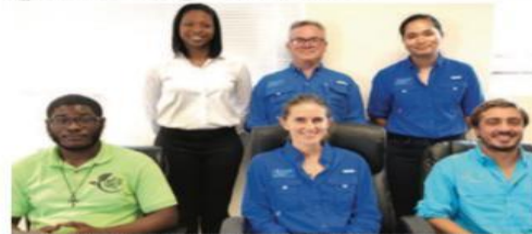
Members of the Asia Pacific Waste Consultants company (dressed in blue), alongside representatives of the Ministry of Health, Wellness and the Environment (dressed in white) and Zero Waste Antigua and Barbuda (dressed in green).