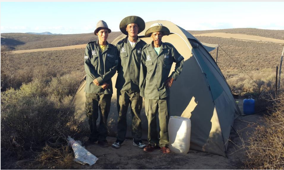
“ECO RANGERS / ECO HERDERS”