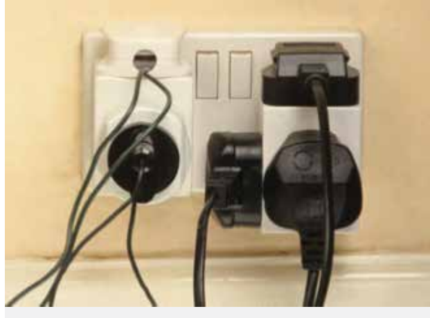
Reducing energy Using: Plug Loads