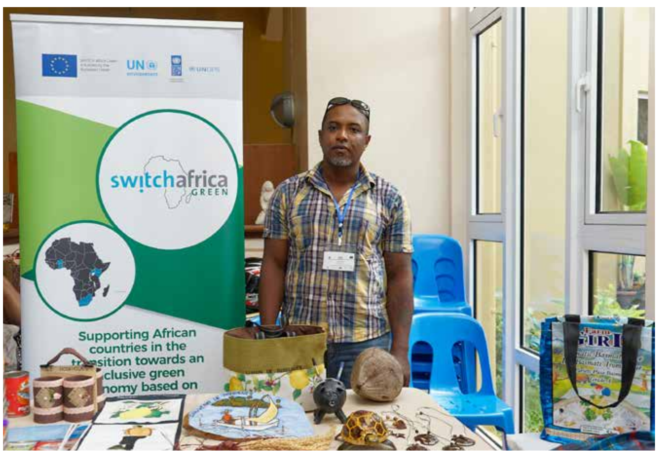
An entrepreneur from Rodrigues showing products made from paper waste at the forum in Rodrigues