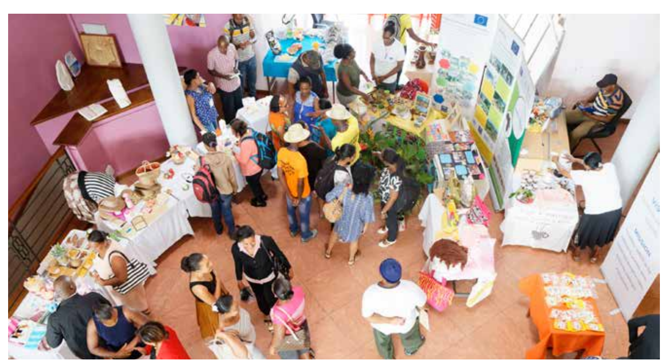
A section of the exhibition area in Rodrigues where 31 entrepreneurs exhibited their products in various sectors

33 beneficiaries who had gone through various SAG trainings including book-keeping, candle and soap making, making soft toys, horticulture and making beauty products were awarded certificates during the forum. About 320 people have so far been trained since the project started and are operating various enterprises applying sustainable production and consumption practices in their business. 90% of these entrepreneurs are women. 31 of these businesses displayed their various products in an exhibition during the forum. Various topics were discussed during the forum including the local context of Green Economy and the Instruments for Entrepreneurship and Services. Eight SWITCH Africa Green entrepreneurs made presentations, sharing their experiences on how they have been able to implement Sustainable Consumption and Production (SCP) practices in their businesses. Rodrigues Island has three grantees working with about 1000 MSMEs helping them green their businesses with a focus on Agriculture, Manufacturing and Tourism as the priority sectors.