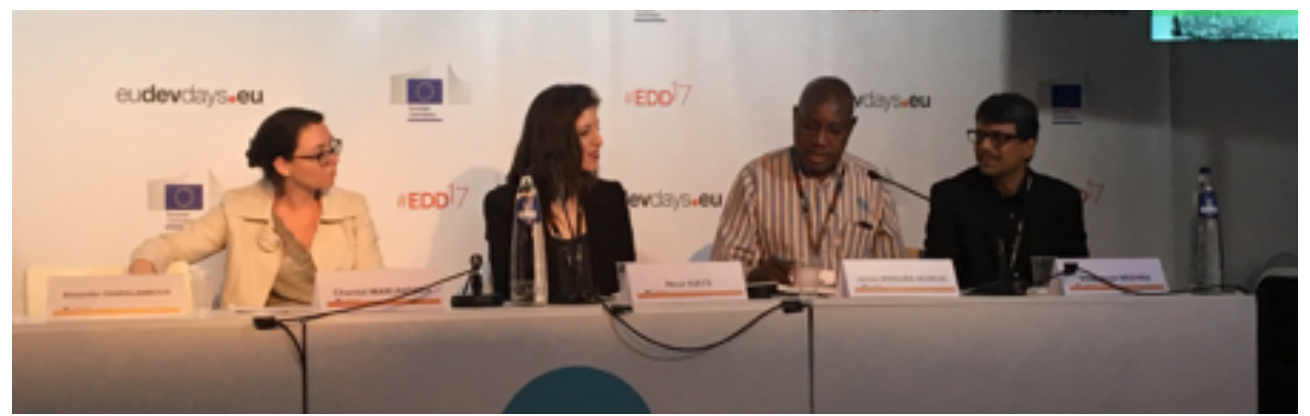
The panelists at the project lab where discussions focused on businesses switching to green with innovative support services

Asia), explained what was the added value to his business of engaging in the SWITCH-Asia programme, highlighting those aspects that supported the decision to switch to green production.