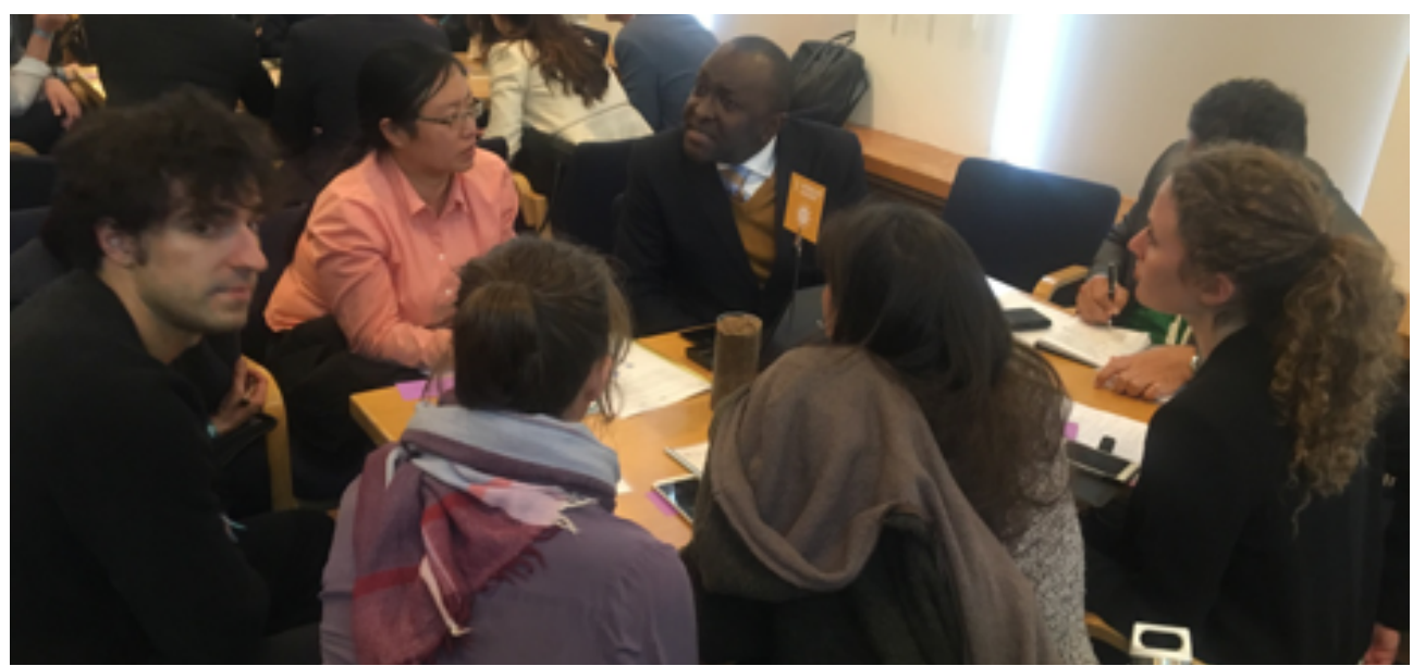
Participants hold discussions during the meeting