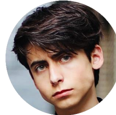
Aidan Gallagher, UNEP Goodwill Ambassador, Actor, Singer-Musician and Environmental Activist