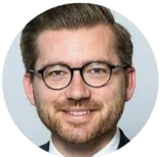
H.E. Sveinung Rotevatn, President of the 5th United Nations Environment Assembly (UNEA-5) and Minister for Climate and Environment of Norway