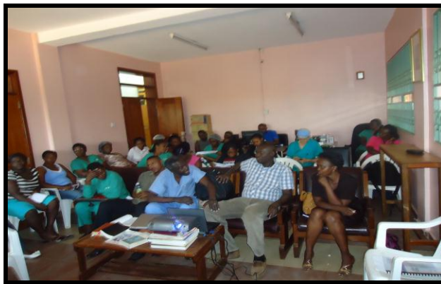
Figure 4: Training at Mengo Dental Clinic

In addition, the demonstration clinics received the equipment (amalgamator and light cure machine) as well as some restorative materials that were donated for the project. Copies of the awareness literature for patients, dentists, and the community were provided to the clinic.