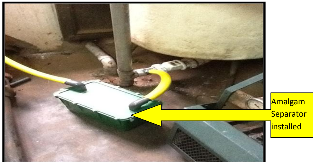
Figure2: Amalgam Separator installed at the clinic

A small Amalgam separator (green) of 9kgs was installed to the wet suction system. Piping connections to the drainage and a run test of the suction system after installation were done. The system functioned well.