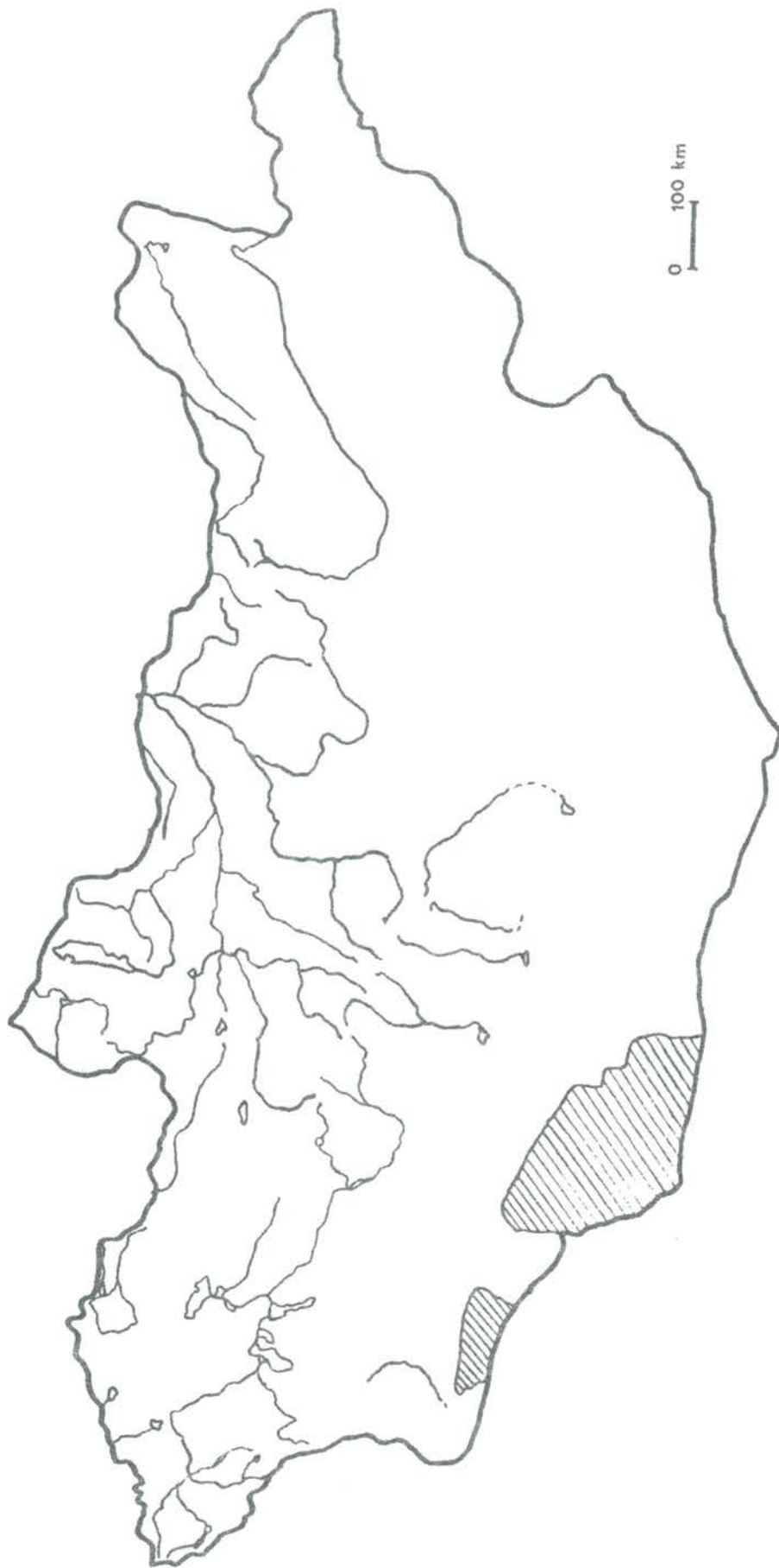
Mongolian People's Republic, with the indication of the planned Transaltai Gobi National Park and Djungarian Gobi Wildlife Reserve.