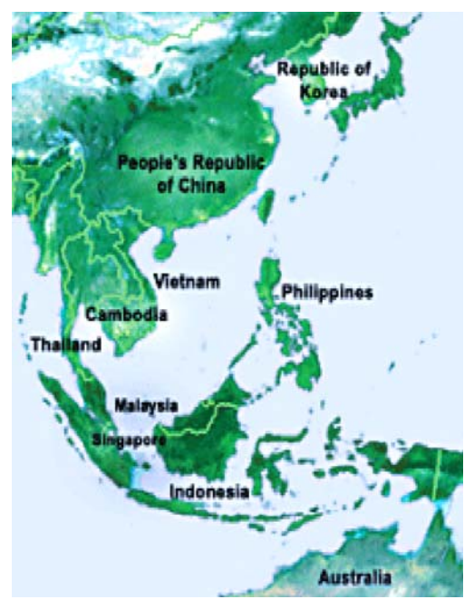
Figure 1: East Asian Seas region showing the COBSEA member countries (non-COBSEA members Brunei Darussalam, Japan, Papua New Guinea and Democratic People's Republic of Korea are not labelled)

According to the Regional Review of Marine Litter in the East Asian Seas region, there is currently very little systematically collected quantitative data on the extent and impacts of marine litter in East Asia. Relatively good data is available for only two countries in the region, Republic of Korea (a COBSEA member) and Japan (a non-COBSEA member). In Australia, some data is available from various uncoordinated survey and monitoring efforts, undertaken at various geographical scales by different parties. In Indonesia, systematic marine litter surveys have been undertaken in the Thousand Islands off Jakarta since the early 1980s. Additionally, some semi-quantitative data on marine litter is available from the Ocean Conservancy's International Coastal Cleanup (ICC) and similar programmes that are conducted annually at restricted sites in all COBSEA member countries except Cambodia in recent years.