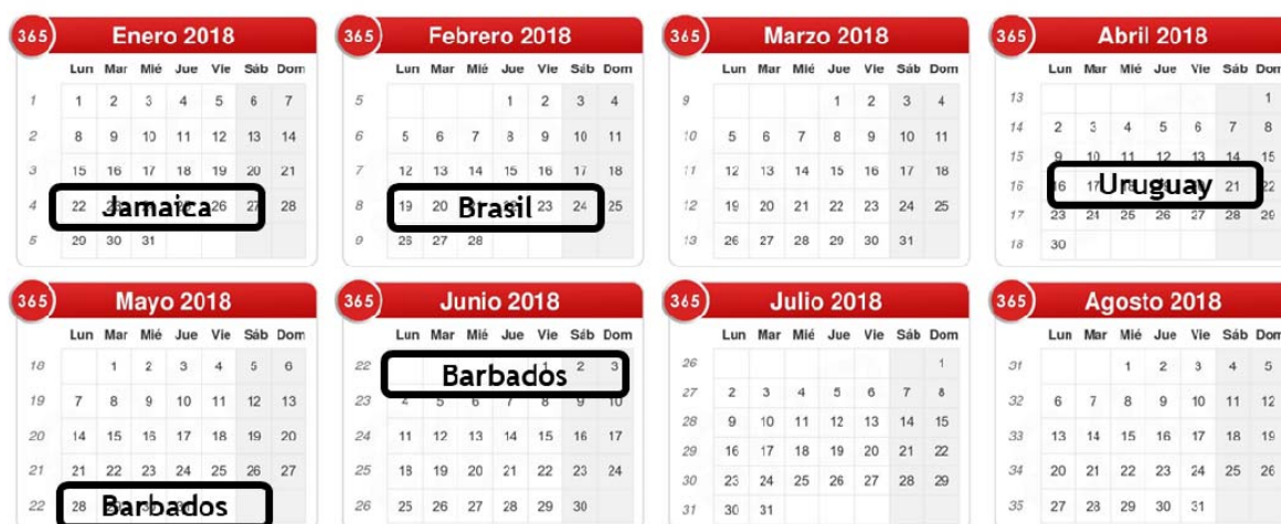
Figure 1. Training and Capacity Building courses calendar for the first semester 2018.

This report makes reference to the activities carried out during the Capacity Building and Training Course organized for Barbados.