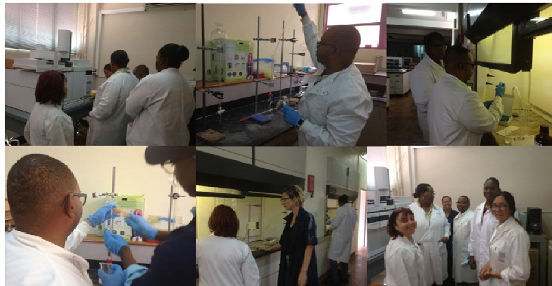
Figure 2. Some pictures of both attendants and teachers during the training in Barbados.

Figure 2 shows some pictures corresponding to a certain moment during the training in Barbados. In addition, achieved data obtained during the training is also showed in Figure 3.