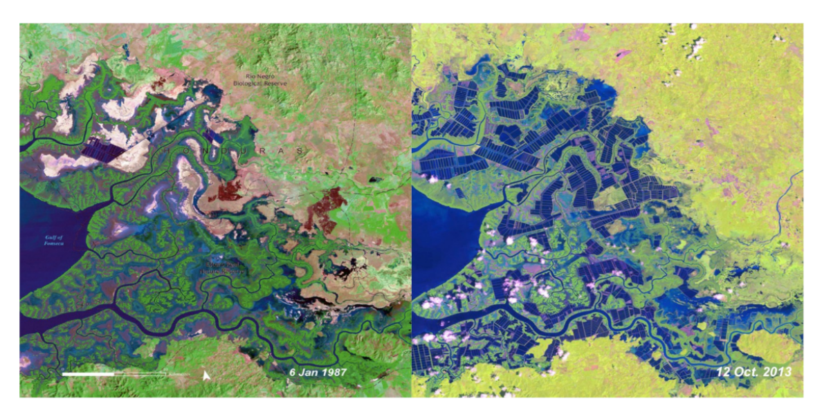
Figure 1. Conversion of mangroves into shrimp farms in Honduras (left extracted from UNEP, 2005; right image analysis by Pascal Peduzzi using Landsat 8 from 2013).

Today, more than 50% of the terrestrial planet has been transformed by human activities [40]. To feed the increasing population and produce more meat, large stretches of forests are being cleared and converted into cropland and pastures [41]. Between 2010 and 2015, 11 million ha of forest were cut down, mostly for conversion to crop land [42]. The largest deforestation occurred in Amazonia, Borneo and the Sumatra islands (Indonesia), and in Africa, as well as in the boreal forests of Canada and Russia. More than half of the world's mangroves have been cleared, often for conversion to fish/shrimps farms (see the example from Honduras in Figure 1).