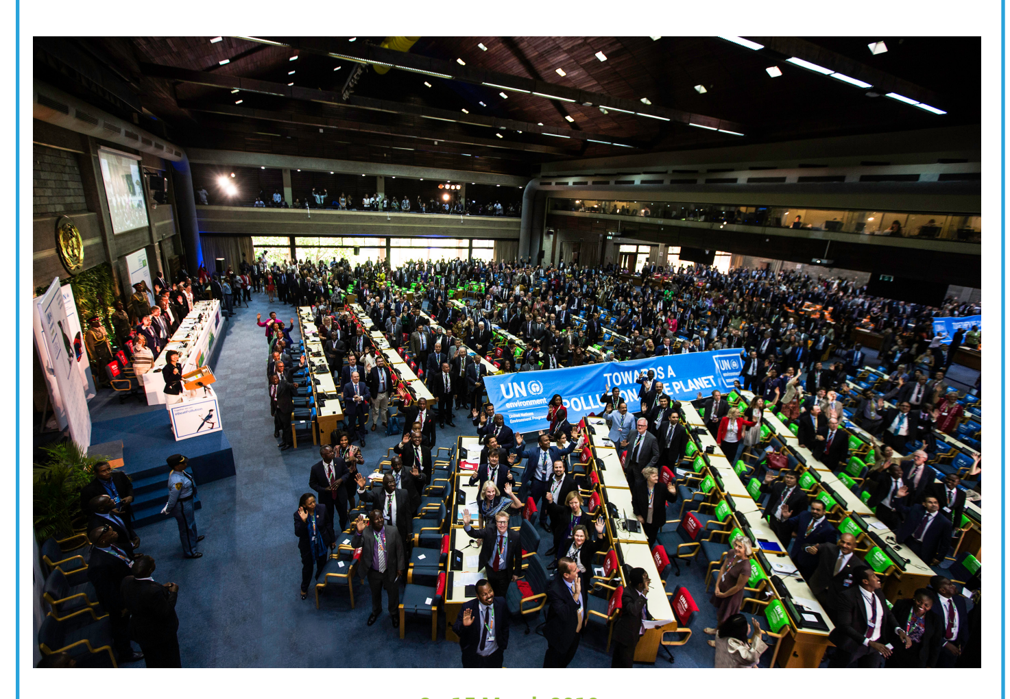
8 - 15 March 2019 Nairobi, Kenya