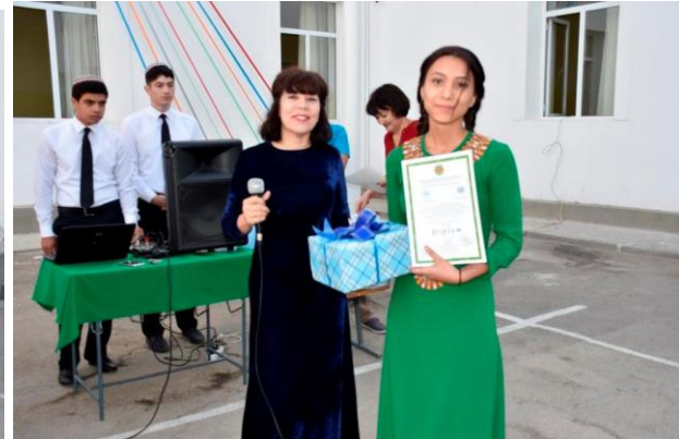
Afternoon on the September 16 at the Ozone office was meeting with 21 students of the Tourism-business vocational school of The State Committee for Tourism of