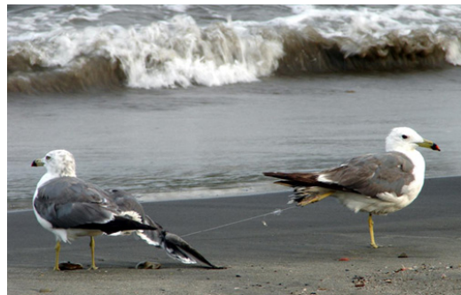
Japanese Society for Preservation of Birds ( http://www.jspb.org/ )