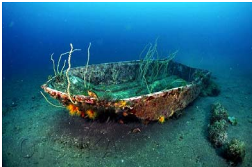
Yukihiko OTSUKA © ( http://zad92731.blog41.fc2.com/ )