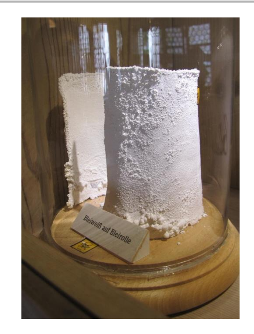
White lead from the workshop of Albrecht Dürer, Nürnberg, Germany