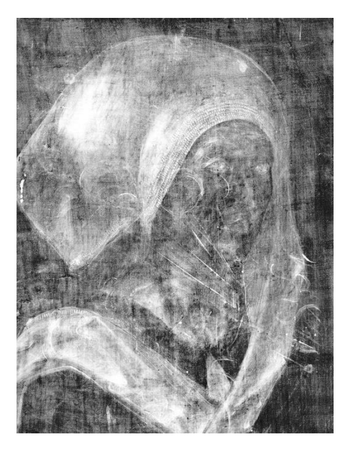
Portrait of the mother, Albrecht Dürer, around 1490 (with x-ray)