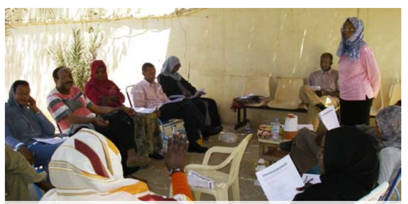
At the start of the field work for the review, the three State Coordintors, three Focus Group Discussion Leaders; a representative from FAO Geniena, a representative from RCSO/OCHA Nyala; three representative from RCSO/OCHA El Fasher; three enumerators from CHF El Fasher, and four enumerators from Practical Action, all undertook training in El Fasher, after which they developed the data gathering tools.

The outputs of the training and planning sessions included the development of the review tools outlined below: