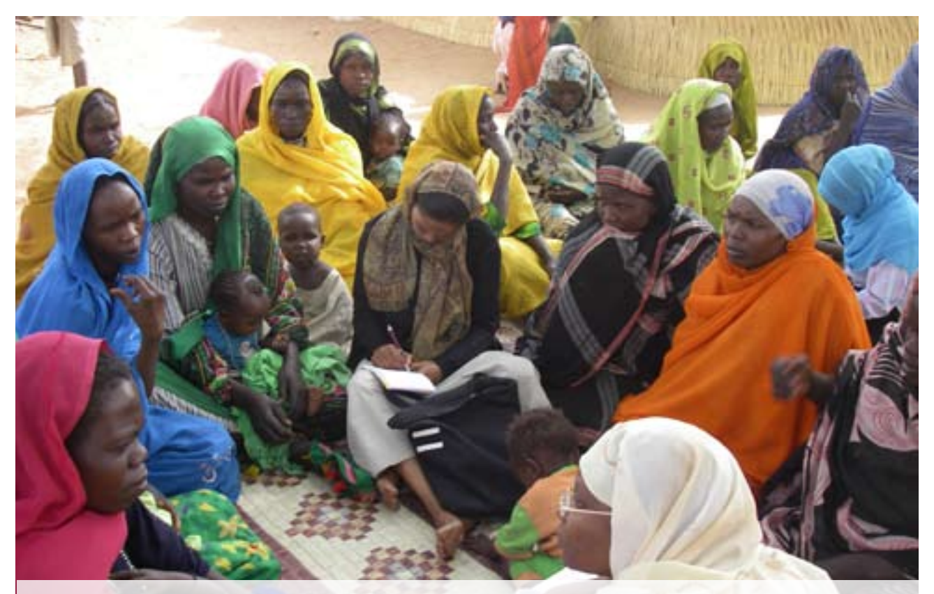
Observations recorded in this review are largely based on a series of consultations held with different stakeholder groups across the three states.

In summary, when the stated objective for which a FES project is introduced is related to the protection of women from GBV, the proxy indicator is the reduction of the probability for exposure to GBV attacks. From the discussion above, however, one can conclude that even an effective FES project does not provide a total solution to protection issues. A range of social and livelihood issues are still going to influence the behaviour of people, especially given their considerably altered situation, space and pressure which they face in camp-like situations. While FES programmes will offer some reduction of the probability of exposure to GBV, some women, at least, are still likely to leave the camps for other, perhaps non-related matters.