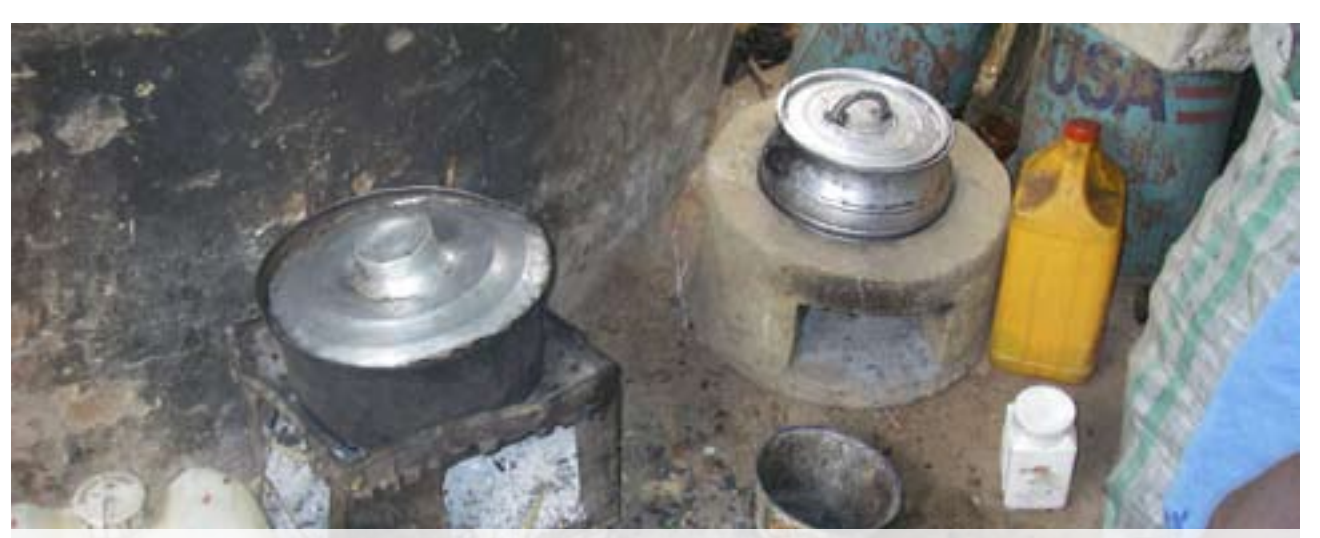
Different types of stoves are promoted by different agencies. Other models may also be available in markets. It is not surprising therefore that many IDP kitchens may feature more than one type of stove, an issue that may also reflect cooking preferences among some women.

Fuel-efficient stove projects have been restricted to camps in government-controlled areas, with extremely limited coverage of the rural and urban areas. A large number of international and NGOs and have been engaged to differing degrees with FES activities in Darfur. In some cases these have been in partnership with United Nations (UN) agencies such as the FAO and United Nations Population Fund (UNFPA), but there have also been other forms of partnerships within the International NGO community, both within and across states. Limited partnerships were observed within the national NGO community, and between national and international NGOs. For example the International LifeLine Fund (ILF) has undertaken a number of partner projects with Relief International, SUDO, SAVEUSA, ACF, UNFPA, and DAI. Some partnerships were, however, noted between national NGOs and certain UN agencies.