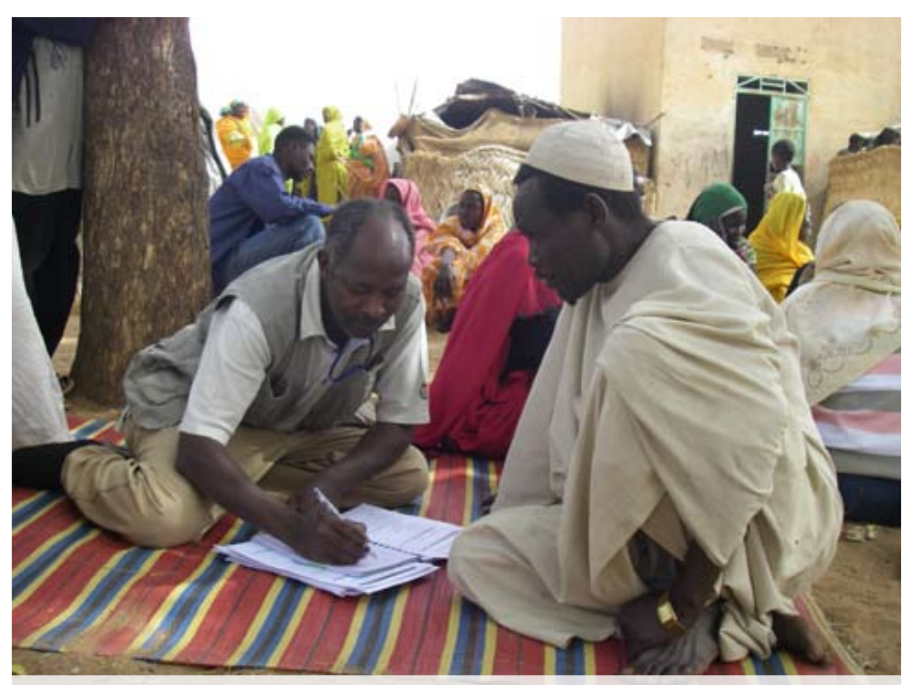
Data was also gathered through Key Informant Interviews with non-FES users, such as charcoal burners, local stove traders or, as here, local wood sellers.

In North Darfur, the FES Working Group has facilitated the establishment of a Demonstration Centre. While this is an important initiative, the fact that most of the explanations are done in English decreases the potential and extent of the service to IDPs and others.