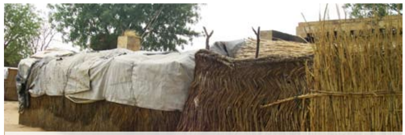
FES projects may assist in limiting the risk of exposure to gender based violence by reducing the number of visits that women have to make outside of the camps to collect fuelwood. Apart from firewood collection however, there may be other reasons that women leave the safety of the camps – such as the collection of grasses and other building materials.

In West Darfur, co-ordination of FES issues is extremely challenged. The FES WG rarely meets and information exchange is very poor between and among FES implementing agencies. The persistence of FAO in monitoring the various FES projects has helped keep the information flow at a manageable limit. Beyond FAO, however, there is a wide information chasm between FES implementing agencies. There are also limited contacts between these agencies and the FNC, which is mandated by the government to co-ordinate such domestic energy conservation related initiatives. A few NGOs have