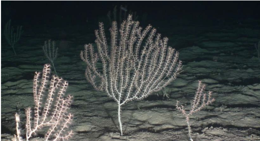
Fig. 3 Isidella elongata population in the Ausiàs March Seamount (Balearic Islands) at around 500 m depth. A large specimen is visible in the centre of the image.