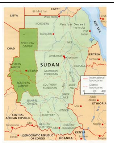
Darfur Region in Western Sudan

The Darfur region of Western Sudan has one million inhabitants made up of 90 ethnic groups. The central belt of the region, an area of medium rainfall, is inhabited by a mixture of agriculturalist and pastoralist tribes and clans. The latter have long migrated seasonally with their animals from the drier north to the more agriculturally productive south in regular and mutually agreed patterns. The area has been continuously affected by Sahelian drought cycles and is experiencing very slow desertification. Traditional migration patterns have been changed in desperation as a result. Farmers complain that pastoralists and their livestock migrate at inappropriate times for the growing seasons for their crops. Pastoralists on the other hand complain that farmers have expanded their farms to encroach on their customary routes as the latter attempt to maintain the aggregate output of crops on land with declining productivity by clearing new areas.