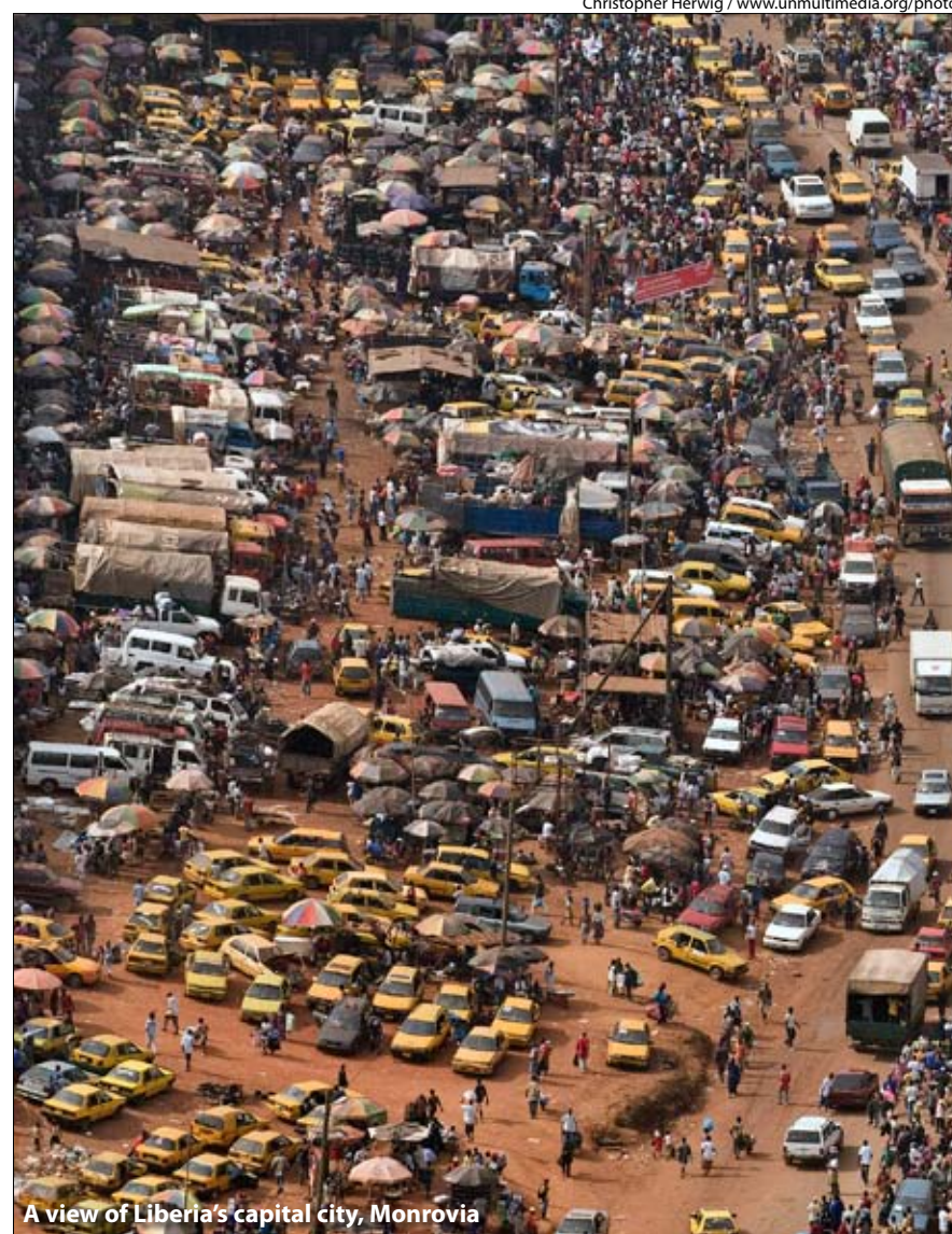
A view of Liberia's capital city, Monrovia