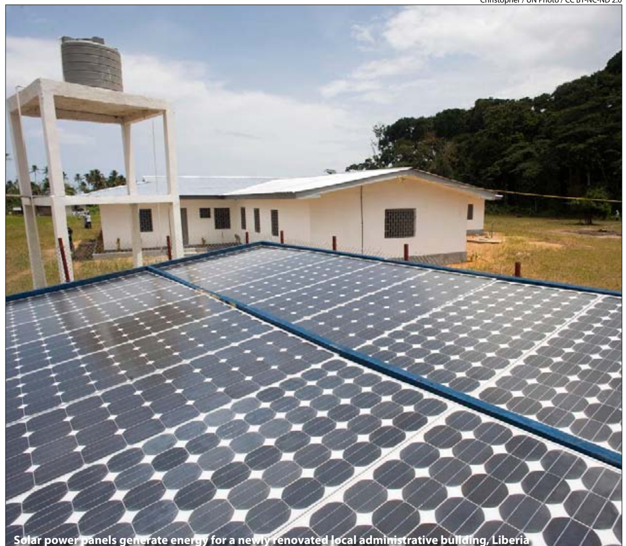
Solar power panels generate energy for a newly renovated local administrative building, Liberia