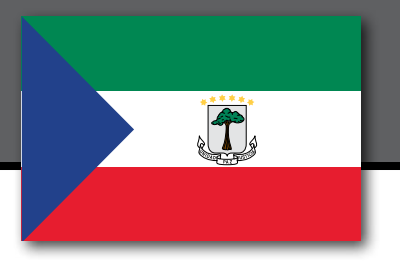
Figure 1: Energy profile of Equatorial Guinea