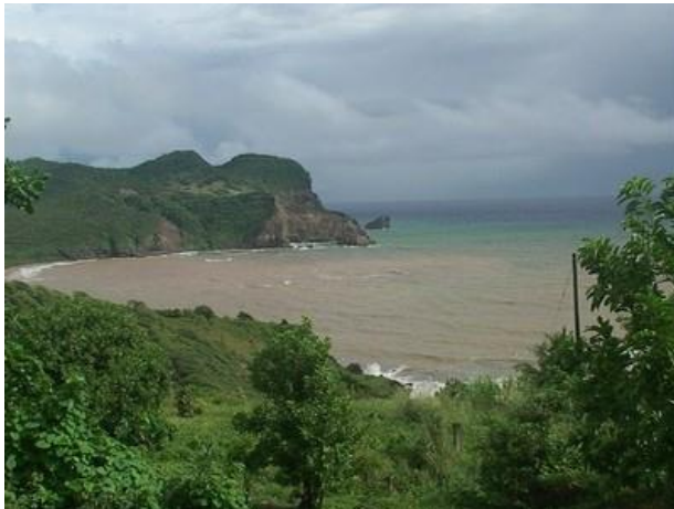
Sediment from the land causes discoloration of water at Fond d'Or Beach

UNEP has supported these processes in Saint Lucia through the publication of guidelines to assist countries to produce their own ICZM policies and plans. UNEP also supported Saint Lucia in monitoring marine pollution and lately, in the development of St Lucia's National Programme of Action for the protection of the marine environment from land based activities.