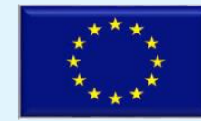
The European Union