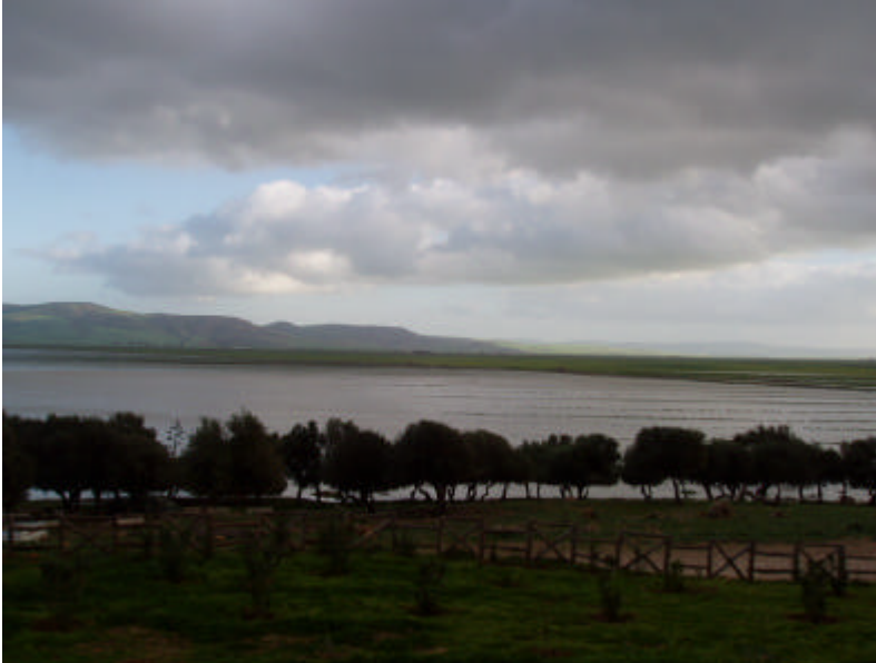
Ichkeul Lake : a Ramsar Wetlands of International Importance.

Some of the Ramsar sites have been inscribed in the Montreux Record, which indicates that they may undergo serious ecological change, and, therefore, merit greater attention and resources to avert it. In the Mediterranean, there are 18 Montreux sites. Unfortunately, this useful tool for identifying sensitive wetlands has not been used in an active way and perhaps its operation needs to be reconsidered.