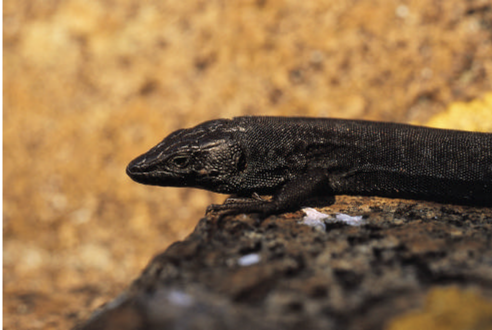
Endemic lizard Podarcis melisellensis ssp. Pomoensis from the island of Jabuka .