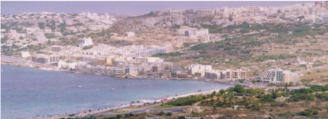
A coastal agglomeration resulting from intern inhabitant emigration from the interior areas towards coastal zones.