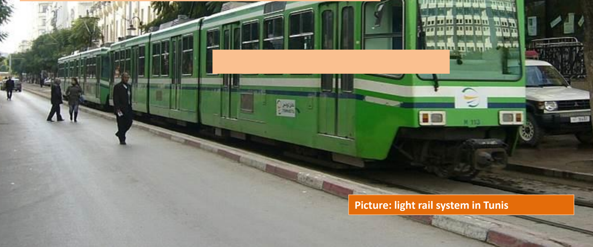
Picture: light rail system in Tunis