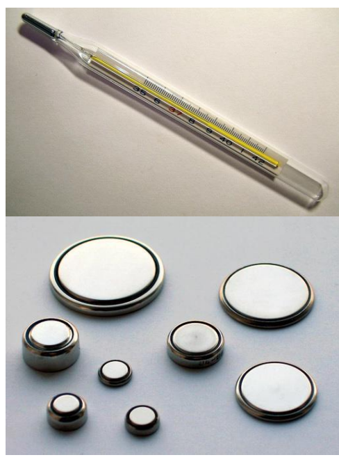
Typical products containing mercury

The partnership has completed numerous global projects dedicated to improving and monitoring data baselines, as well as demonstrating availability and efficacy of mercury-free alternatives. An example of this work is the development of a brochure to provide a concise list of effective alternatives to mercury-containing products.