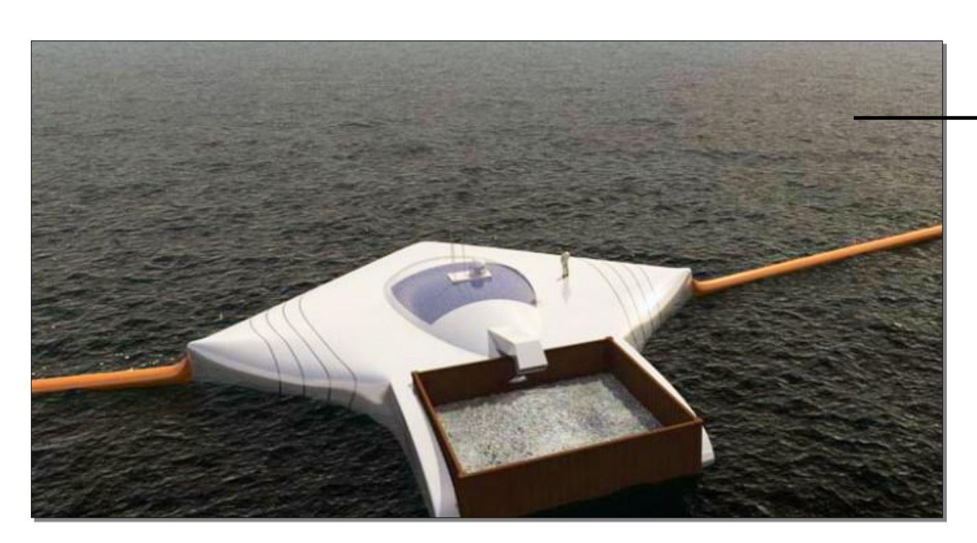
Boyan Slat - Ocean Cleanup Foundation http://boyanslat.com

"The first signal of human intention is design" ~ William McDonough