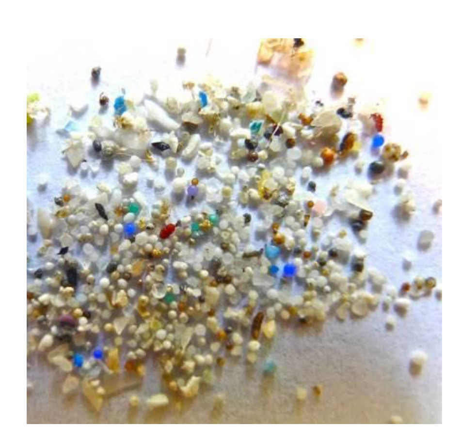
Microbeads from Cosmetics Disposal in Great Lakes