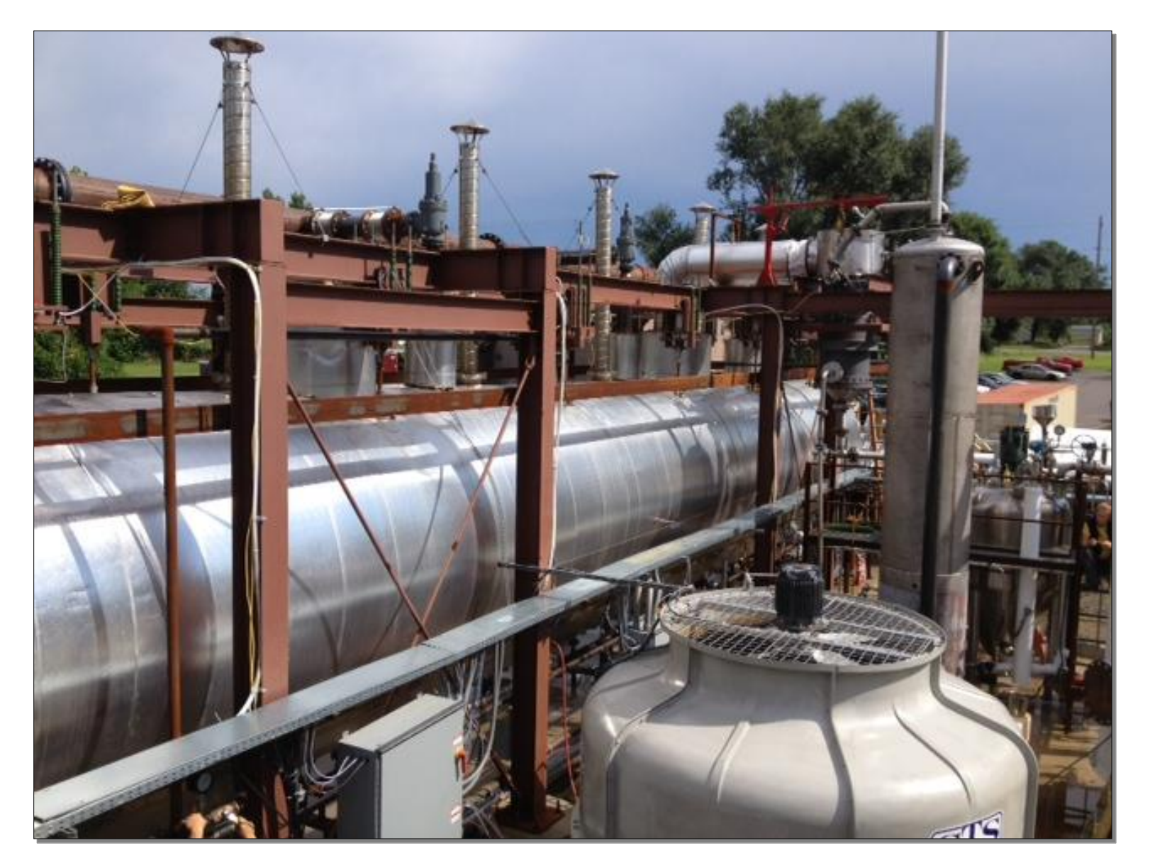
Perry, Ohio facility