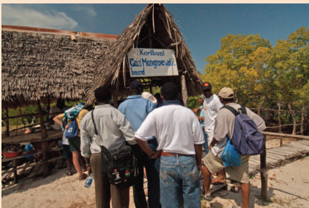
Mangrove boardwalk entrance at Gazi Bay, Kenya.

The development of mangroves as ecotourism sites is growing worldwide. At Gazi, a coastal village in Kenya, the women have established a community-based ecotourism project which profits from the value of the mangrove's scenic beauty and biodiversity. The Gazi Women Mangrove 300 m Board-