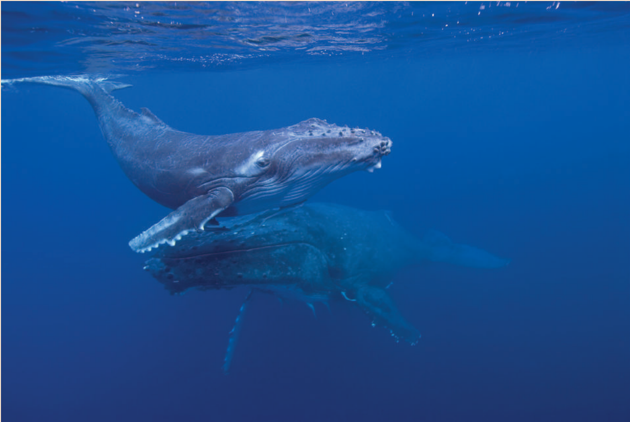
Humpback whales, a major ecotourism target.

Whale and dolphin watching is becoming an increasingly popular recreational and eco-tourism activity (Higham and Lück 2008, Hoyt and others, 2009, Mustika 2013). O'Connor and others (2009), estimated that 13 million people participated in whale watching in 119 countries with direct revenue estimated at US$872.7 million and indirect revenue of US$2 113.1 million. The level of interest in this activity has led to popular support for the protection of marine mammals from commercial whaling and other threats such as by-catch and ship strikes (Draheim and others, 2010, Christensen and others, 2009, Cunningham and others, 2012).