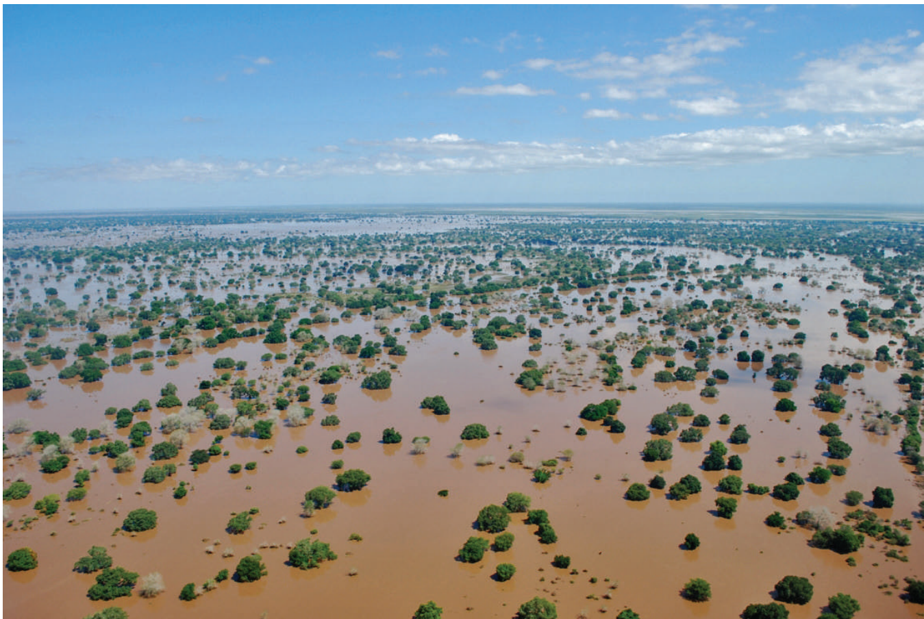
Figure 15.2. Floods in Mozambique in January 2013.