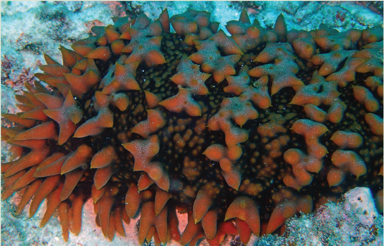
Close-up of a red prickly sandfish, Thelenota ananas , showing the distinctive soft, irregular papillae which give it a shaggy appearance.

Sea cucumbers (or holothurians) are elongate, soft-bodied echinoderms without projecting arms. They have a mouth at the anterior end, surrounded by a ring of 10–30 food-capturing tentacles, and an anus at the posterior. Tube-feet, which are used mainly for locomotion, occur in various arrangements. The skeleton comprises microscopic ossicles of different shapes and sizes embedded in the dermis (skin) of the body wall. Sea cucumbers feed by using their tentacles to collect sediment into their mouths or by suspension feeding from the water. The tentacle shape reflects the type of feeding strategy and aid species identification. There are some 1 400 species worldwide, of which about 140 species occur in shallow waters of the WIO (Rowe and Richmond 2011).