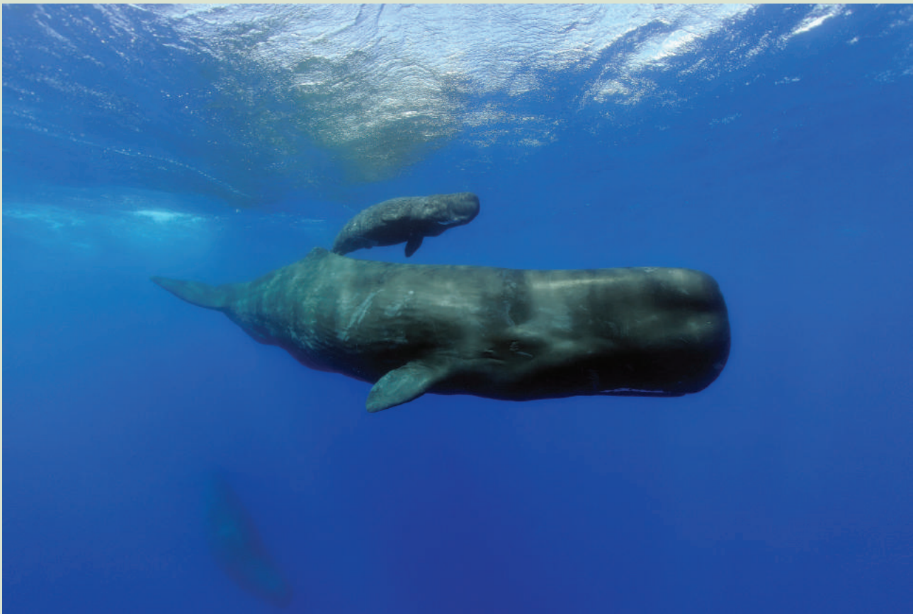
A sperm whale mother and calf off Mauritius in the WIO.

Sperm whales ( Physeter macrocephalus ) are the most iconic of whales, made famous in popular culture by Hermann Melville's 1851 novel 'Moby Dick'. They are found in the tropical zones of all major oceans, including the WIO. Although males undertake seasonal migrations to higher latitudes, female-led groups are likely to be resident in the tropics throughout the year. Sperm whales are characterised by significant sexual dimorphism. While males can attain 18 m in length and 30-50 t in weight, females are typically only 10-12 m and 10-12 t in weight. Sperm whales feed on giant squid at depths of up to 2 000 m and can live for 60-70 years (Berggren 2009).