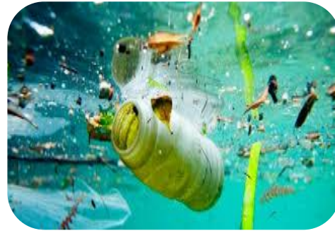
2/11: Marine plastic litter and microplastics