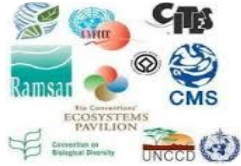
2/18: Relationship between UNEP and MEAs