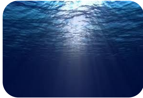
2/10 Oceans and seas