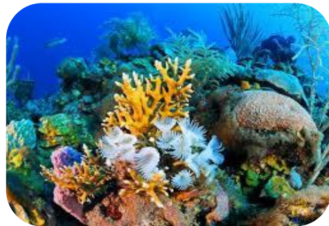
2/12: Sustainable coral reefs management